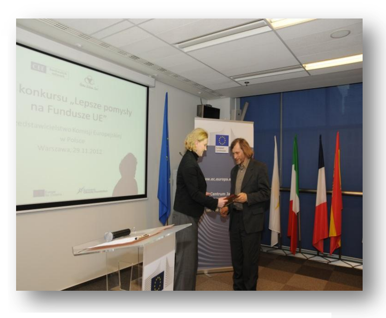
Winners Award Ceremony, Warsaw, Poland 29 November 2012

The project is based on an idea of foundation of Bio-construction Technologies Center in Kock (Lubuskie Voivodship, Poland). The idea is for the development of a professional implementation center focused on eco-passive building technologies. It will be financed from production of bio-building materials, consulting services and trainings. On the preliminary stage it would employ around 15/20 people. The foundation of the center would accelerate the formation of a new market segment in the field of residential buildings and thus would help to achieve tangible results in reduction of CO2 emissions in this sector.