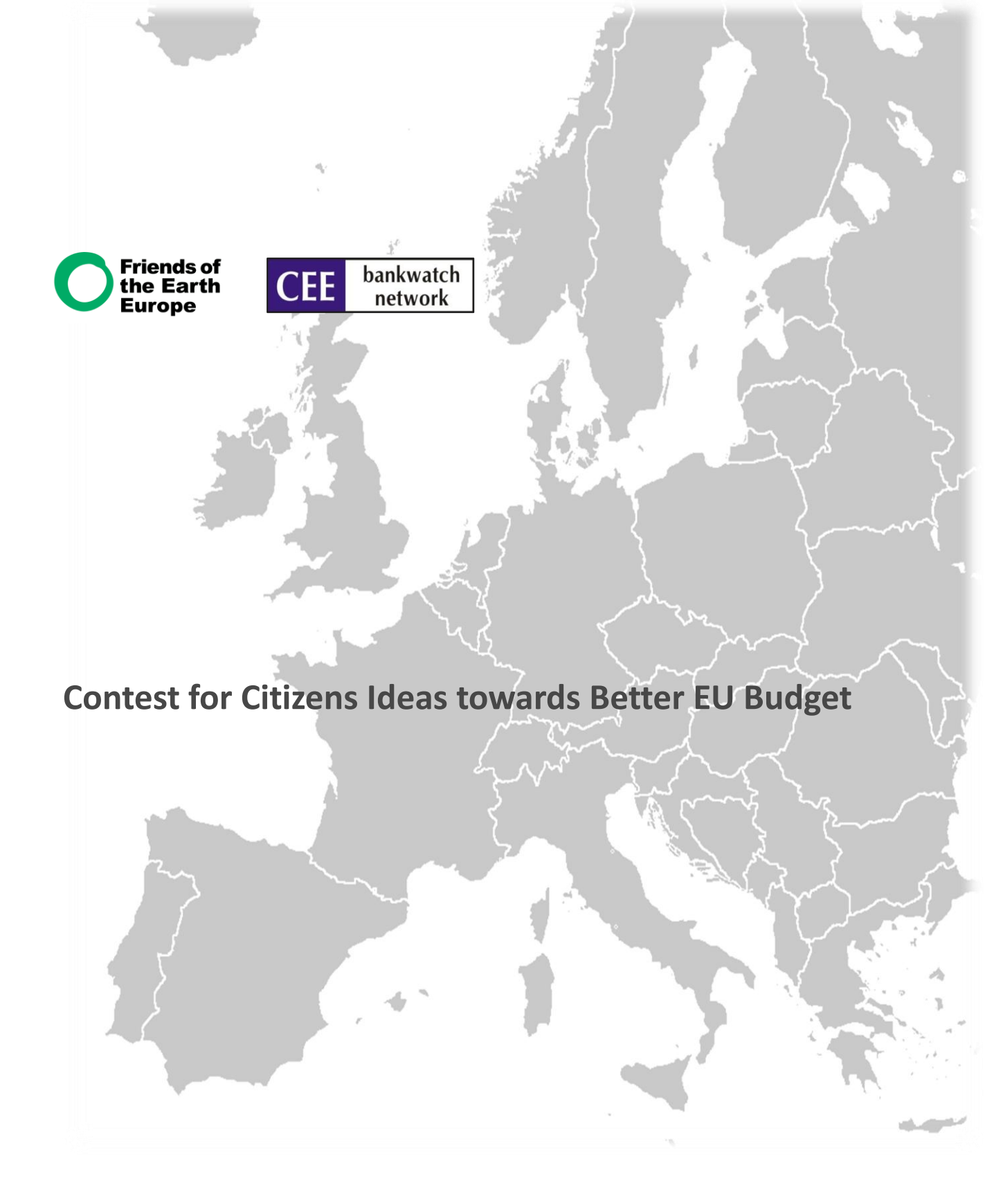
Awarded Citizens Projects