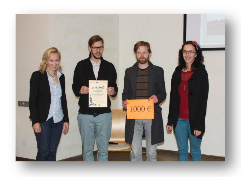
Winners Award Ceremony, Riga, Latvia 22 November 2012

The project aims to increase environmental awareness of children and youngsters and mobilize them to deal with global environmental challenges while contributing to local sustainable development in Riebini County. The ideas and activities have been developed by youngsters themselves and they include production of information materials and drawing books, giving thematic lectures and regularly organizing events in schools of the county and organize exhibition in the end.