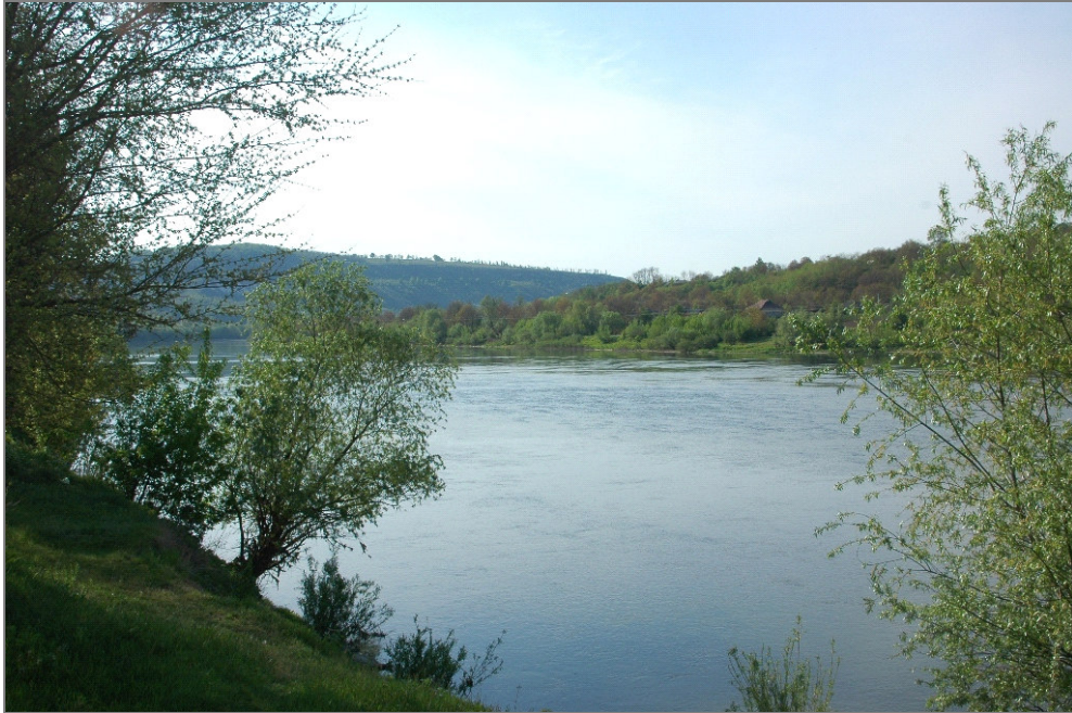
Before construction started