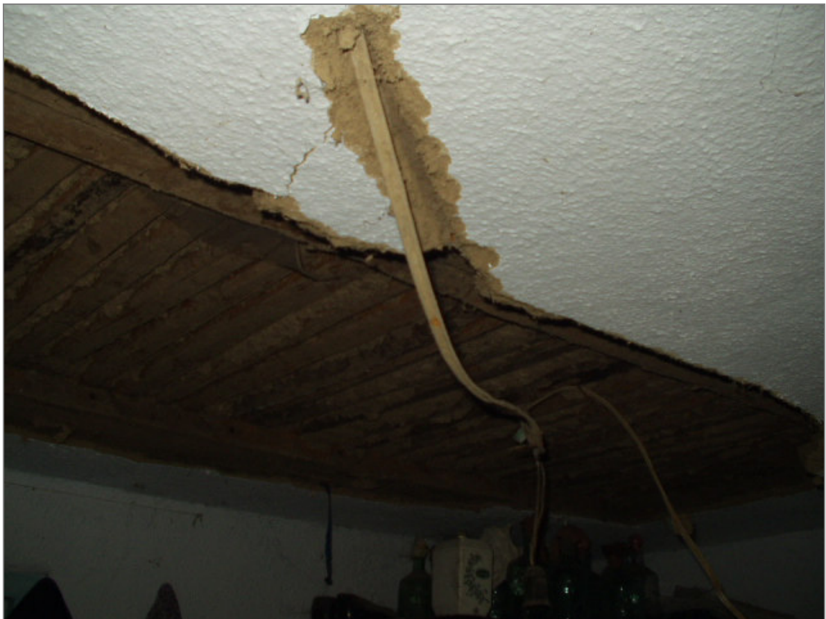
Inside a house next to the road where trucks are passing by.