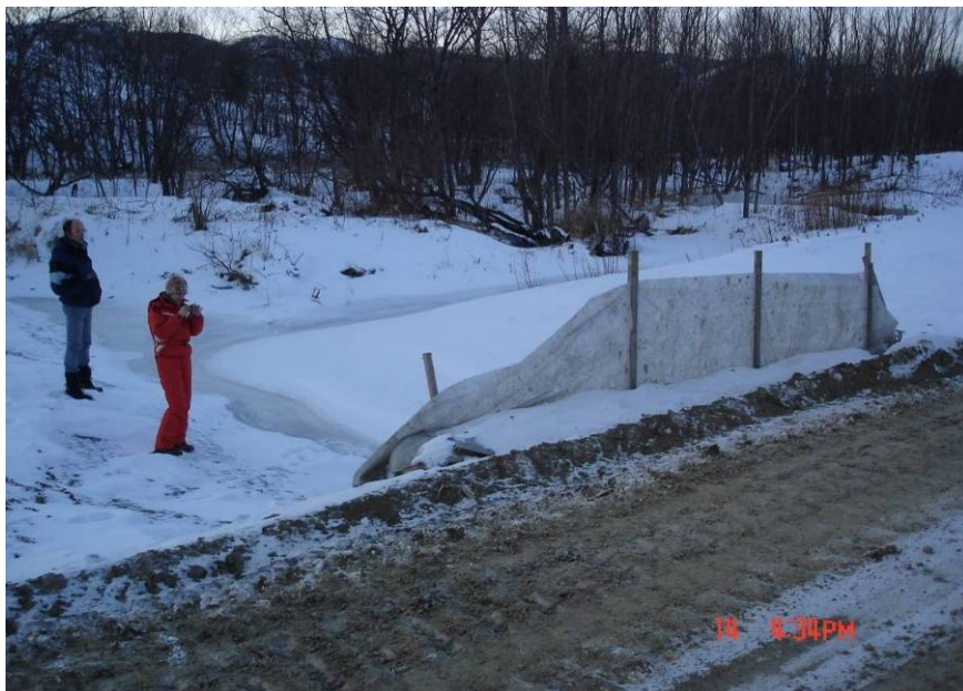
Kp 405.7 Uspenka river. Spread 3.