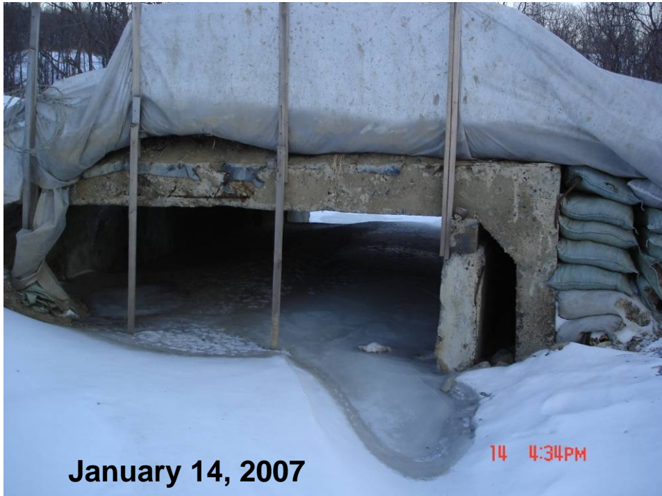
January 14, 2007