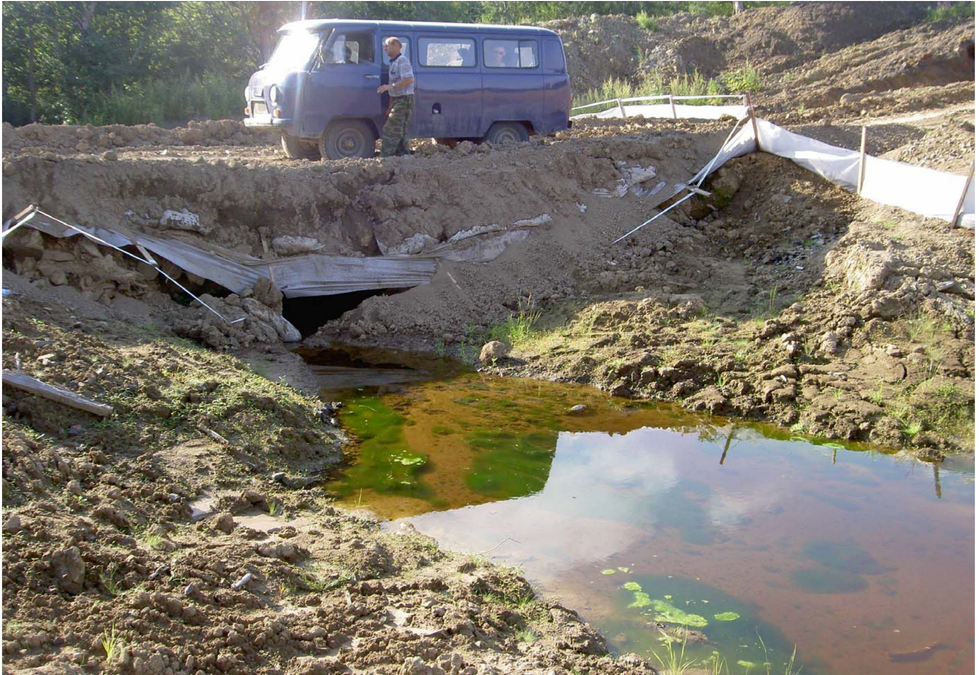
Kp 402,5 Rudnaya river. Spread 3, August, 2006