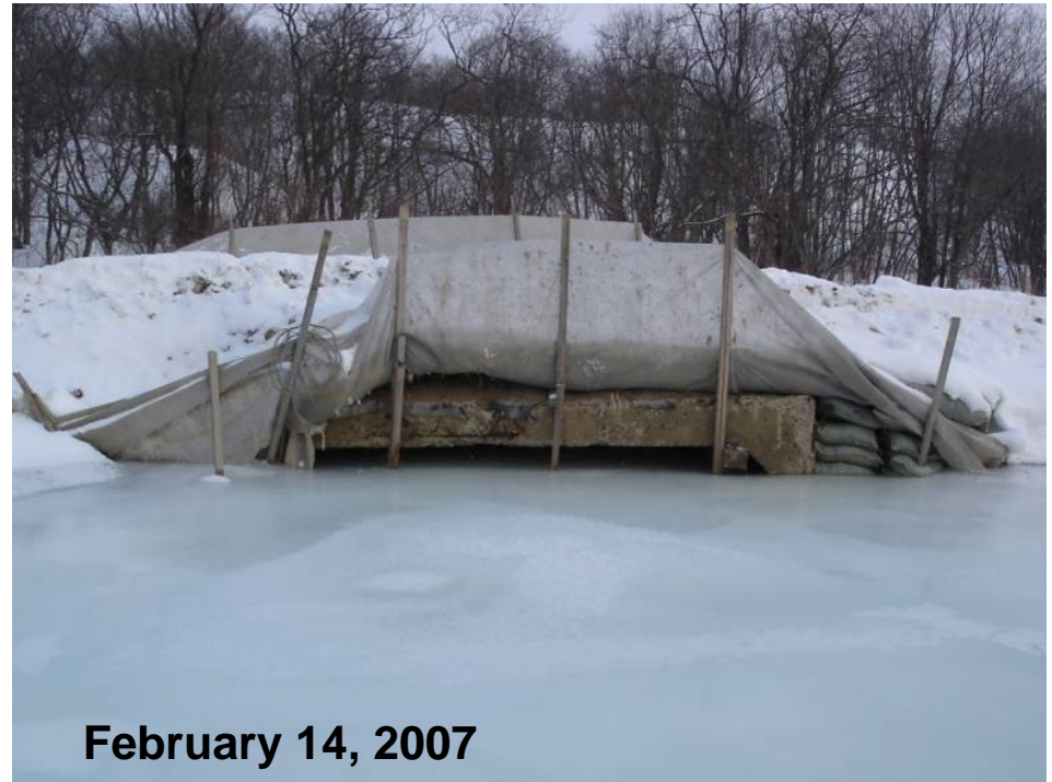
February 14, 2007