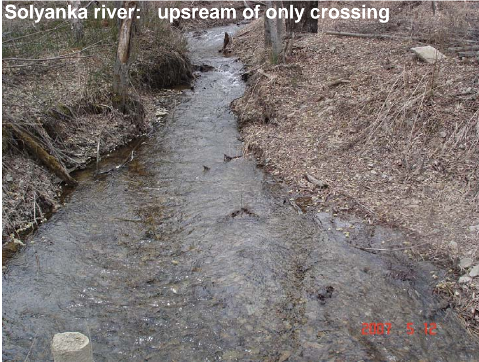
Solyanka river: upstream of only crossing