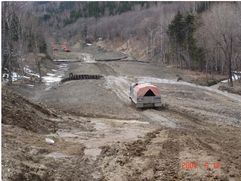
Kp 359.2 Sosnovka river