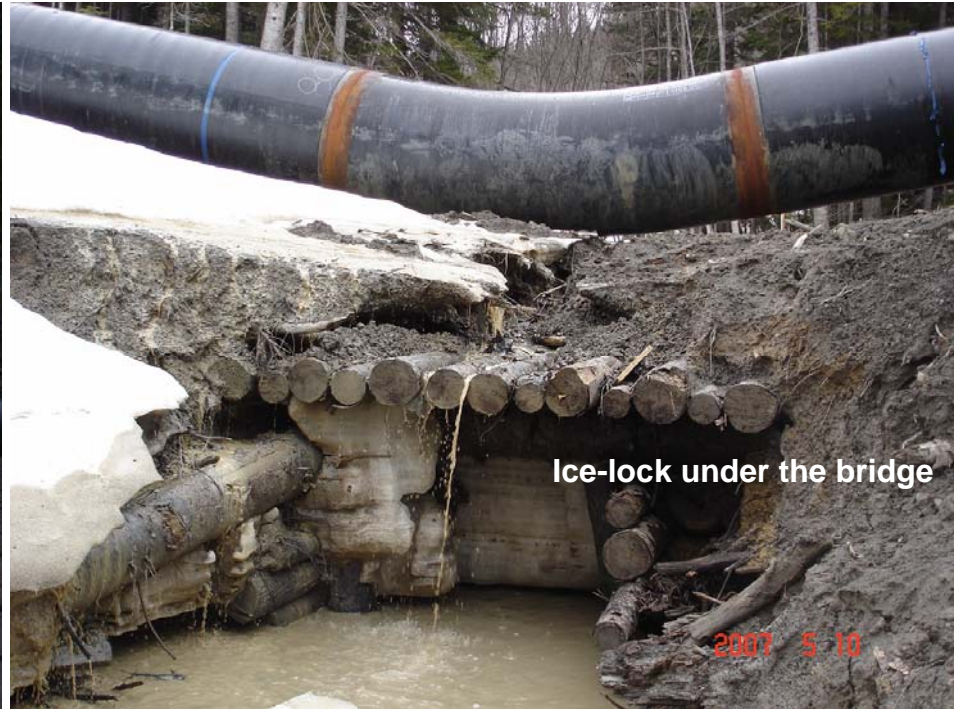
Kp 373.9 Left tributary of Lesnaya river. Spread 3. May 10, 2007