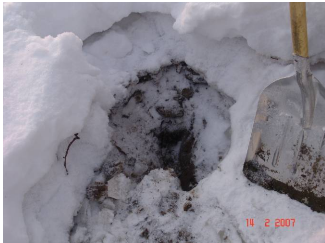
Kp 407.6 Left tributary of Ssora river. Spread 3. February 14, 2007.