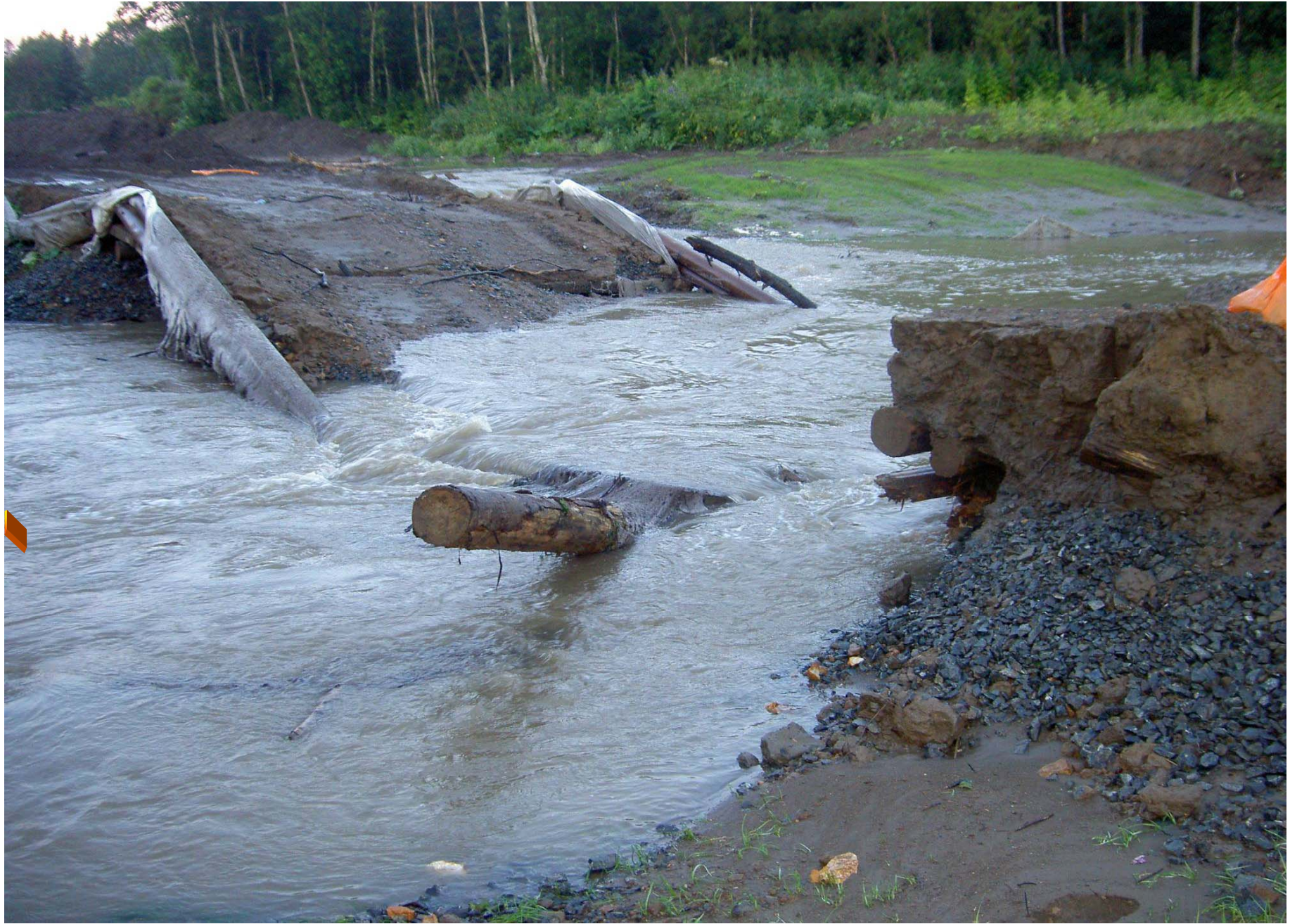
Kp 379.3 Chernaya river