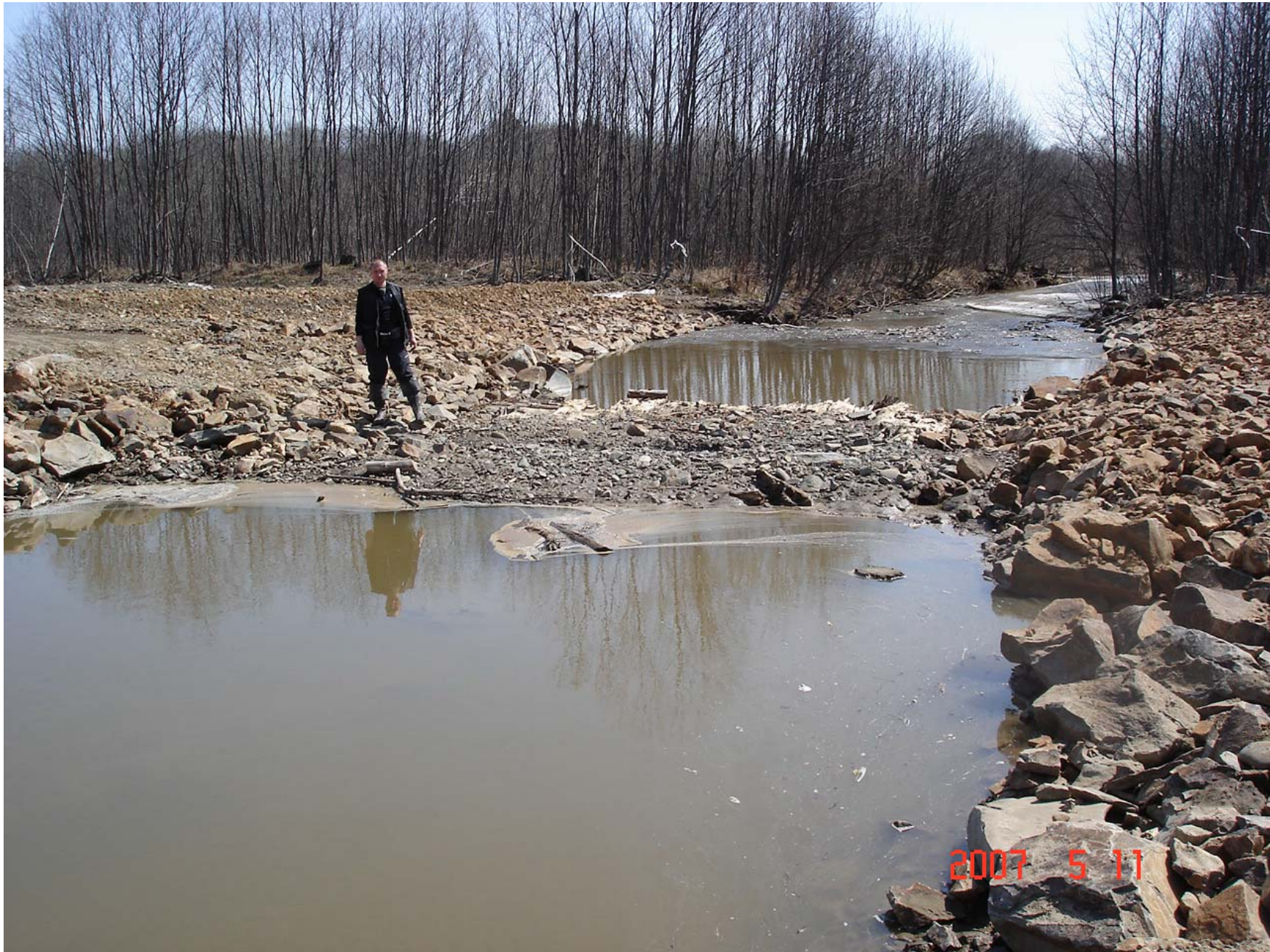
Kp 387.2 Left tributary of Lazovaya river. Spread 3. February 14, 2007.