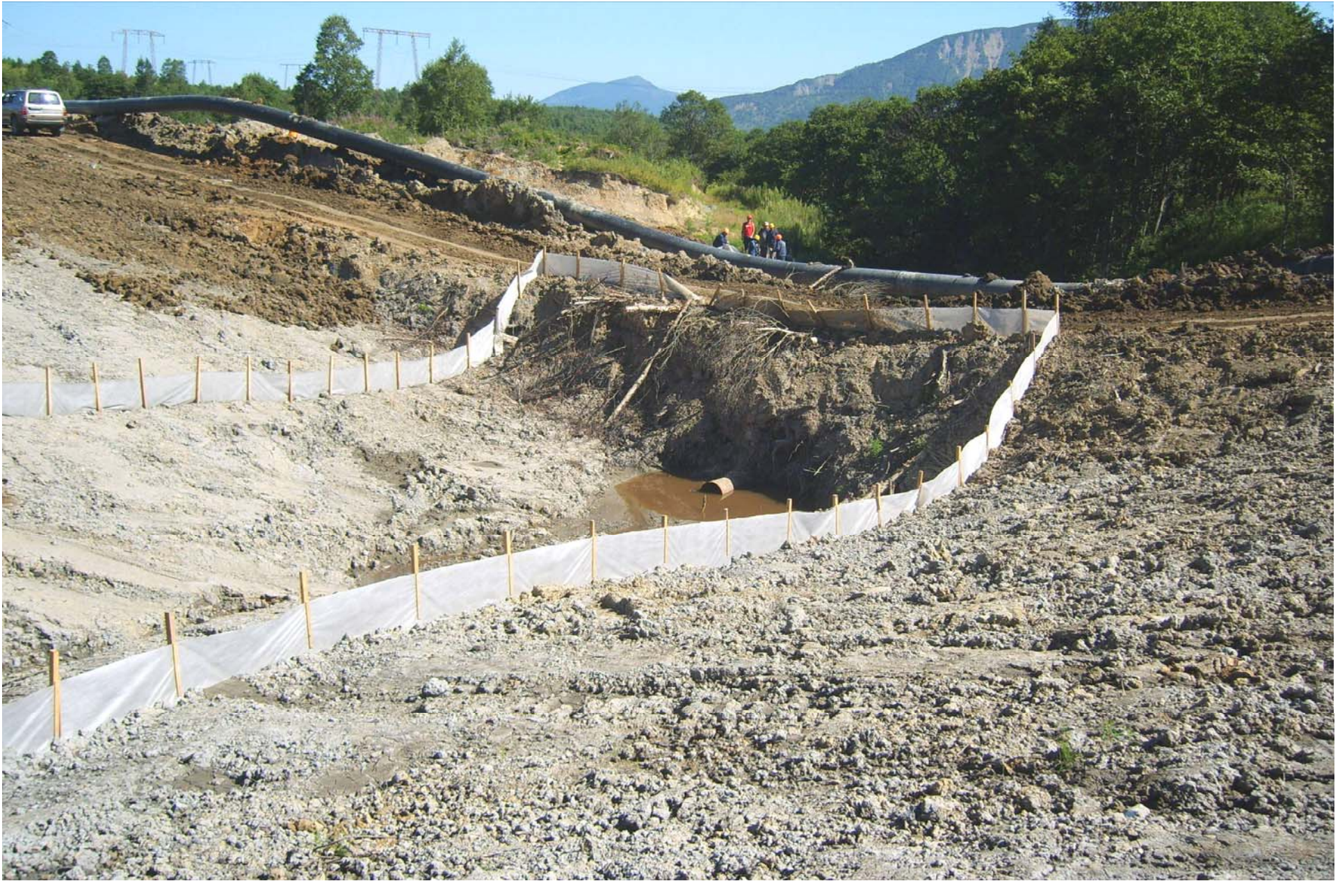
Kp 399,2 Left tributary of Grebenka river. Spread 3, August, 2006