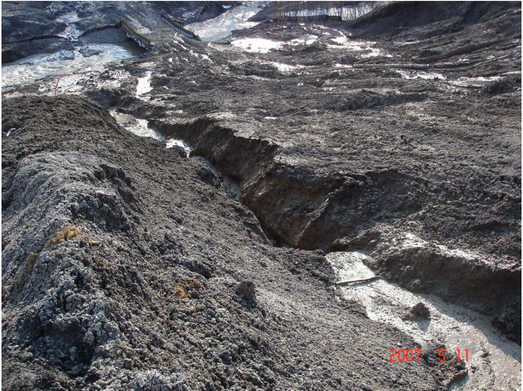
Kp 348.5 Krinka river. Spread 3. May 11, 2007