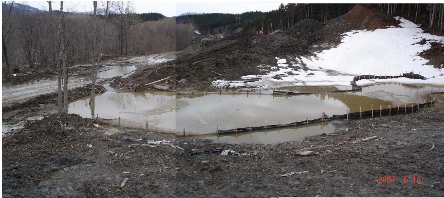
Kp 370 Left tributary of Lesnaya river.