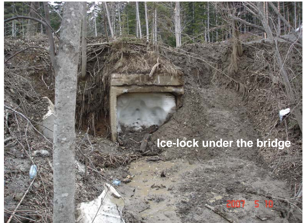
Ice-lock under the bridge