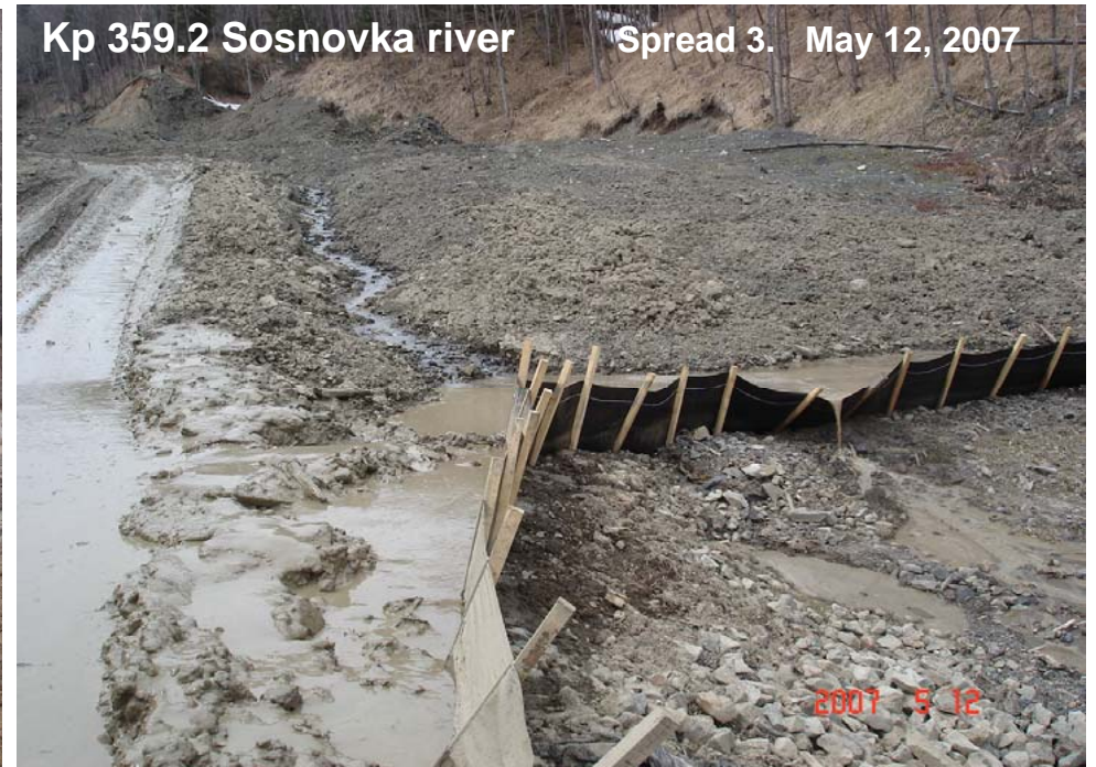
Spread 3. May 12, 2007