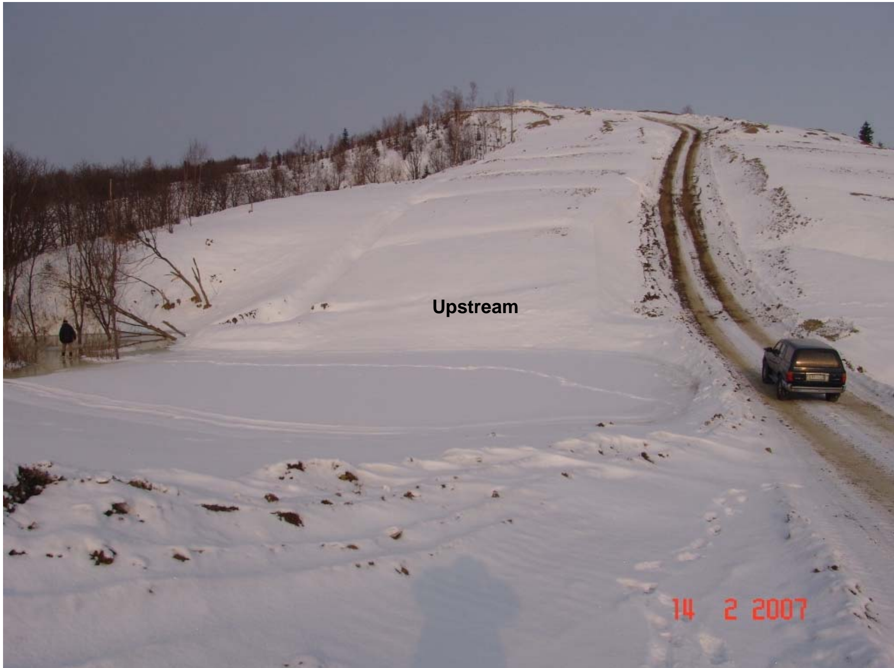
Kp 407.6 Left tributary of Ssora river. Spread 3. February 14, 2007.