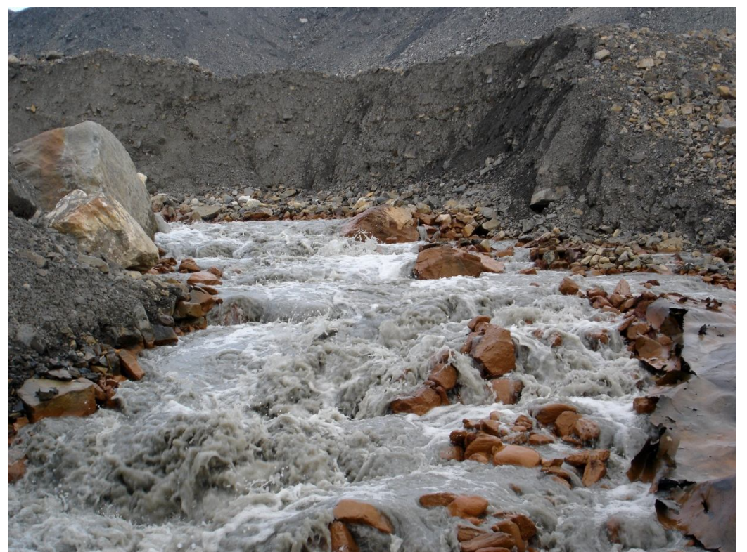
Water flow from the open pit (September 20, 2011)

Mining involves exposing, blasting and crushing formerly buried rock that contains high concentrations of dozens of different metals, metal-like elements and other rock minerals. These mining actions greatly increase the surface area of the exposed rock particles, which increases the tendency for these mineralized rocks to chemically-react with the local waters. Thus, the natural rock components are released into the nearby waters, both as dissolved contaminants and sediment particles. Such processes increase the concentrations of contaminants and sediment particles in the environment, even when the waters are not acidic. However, if significant concentrations of sulfide minerals, especially various forms of iron sulfide (pyrite, marcasite, etc.) are present in the exposed rocks, natural sulfuric acid is formed, greatly increasing the rate at which the metals and other rock contaminants are released into the environment.