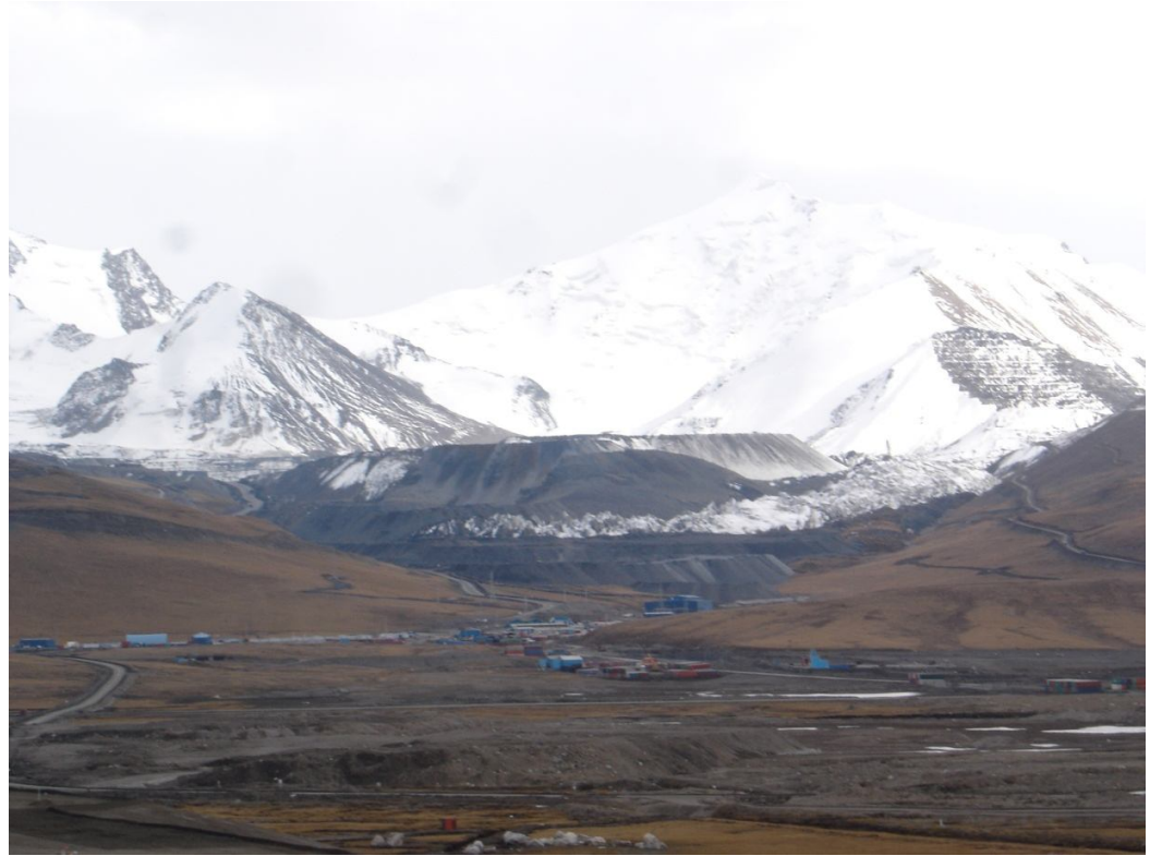
Waste rock on the Davidov Glacier (September 2011)

The TR states that Kumtor has previously placed waste rock on some of the glaciers, which has increased their rate of melting and rates of downgradient movement. Most such waste rock is dark colored and, according to geotechnical experts who have worked at Kumtor, the rock placed on glaciers heats up to about 30 degrees C in the sun, even in winter when air temperatures reach -40C.