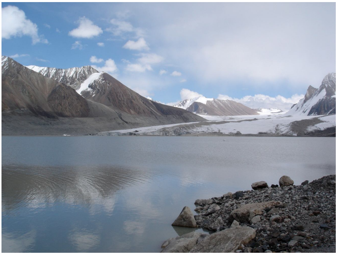
Petrov Lake (September 20, 2011)

Other monitoring data in the 2009 EPR also indicate that mine activities are releasing contaminants from the waste rock on / near the Sarytor and Lysyi Glaciers (monitoring sites W2.4, 2.2, 3.1) into local surface and ground waters. KOC data from snow samples at sites A1.3 and A1.4 show average EC values that are very low in some years [i.e. average EC = 53, 37 and 20 microSiemens per cm at Station A1.3 for 2005, 2006, and 2008 respectively, indicating that, without contamination from the mine wastes and dust, the natural glacial melt-waters have almost no minerals dissolved in them.