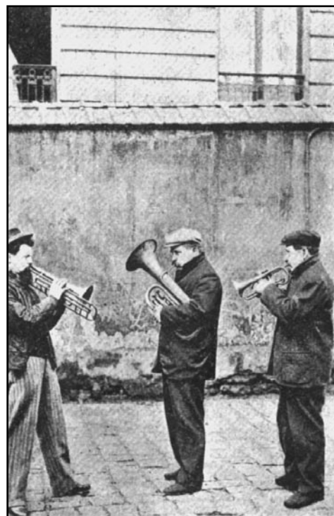
Blow me! The song remains the same for Romania's mines

commitments, policies on the reduction of Acid Rock Drainage or the removal of cyanide from Romania's mining law) the World Bank intends to attach to this loan. Neither the authorities nor the World Bank's representative were willing to provide answers.