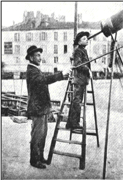
Mining and oil investments: star attractions at this year's Flat Earth summit

► Sakhalin II campaign at SEW website: www.sakhalin.environment.ru/en ► Pacific Environment on Sakhalin II: www.pacificenvironment.org/russia/sakhalin.htm ► ECA Watch on Sakhalin II: http://www.eca-watch.org/problems/russia/sakh2_index.html