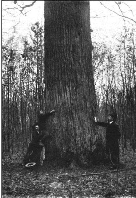
"Getting this out of the country should be no problem"

Although it favours commercial harvesting in Georgia, within the remit of the FDP there has been no study carried out to assess whether such harvesting will indeed contribute to the economic growth of the country. Within this commercial harvesting focus, and carrying a USD 1.98 million budget, there is an emphasis on building "main forest roads and light roads" for access to firewood which is described as a means of "environmental forest harvesting".