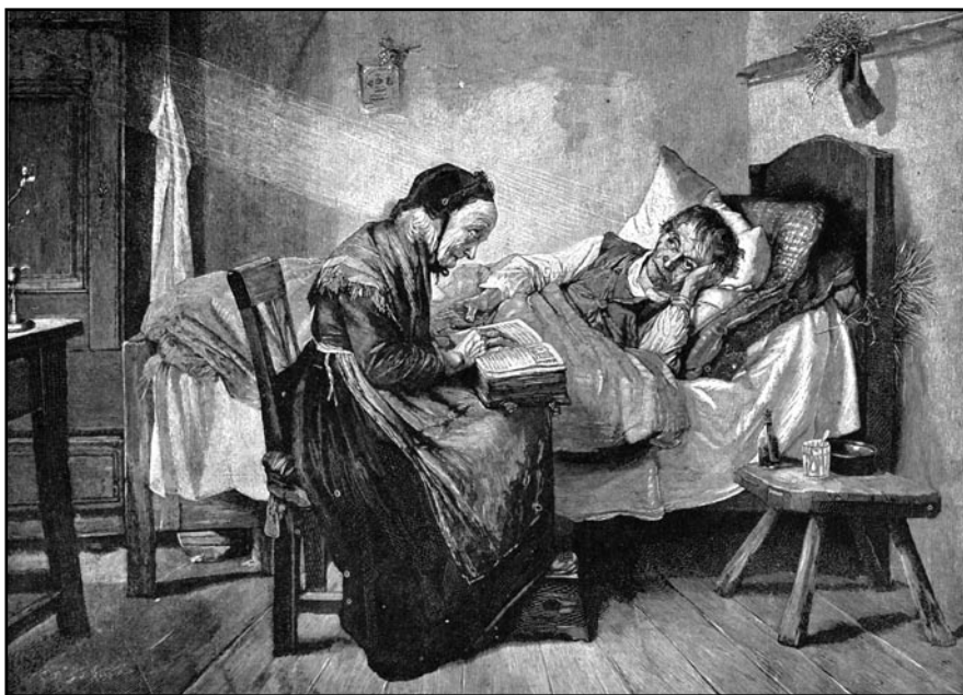
"... and oil pipelines don't produce emissions..."

endars for the trip to Bonn, but also that they come with new ambitious targets for investment in renewables and energy efficiency that will help to speed up the much-needed transition in the energy sector. □