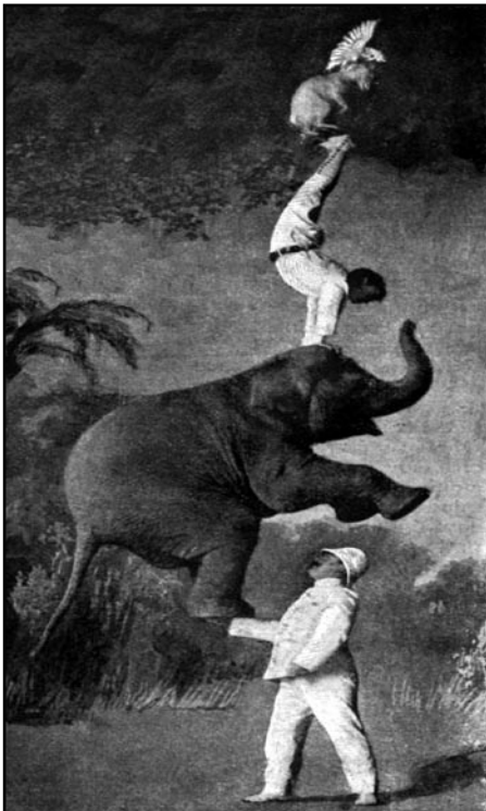
The EIR tango - but who gets the soft landing?