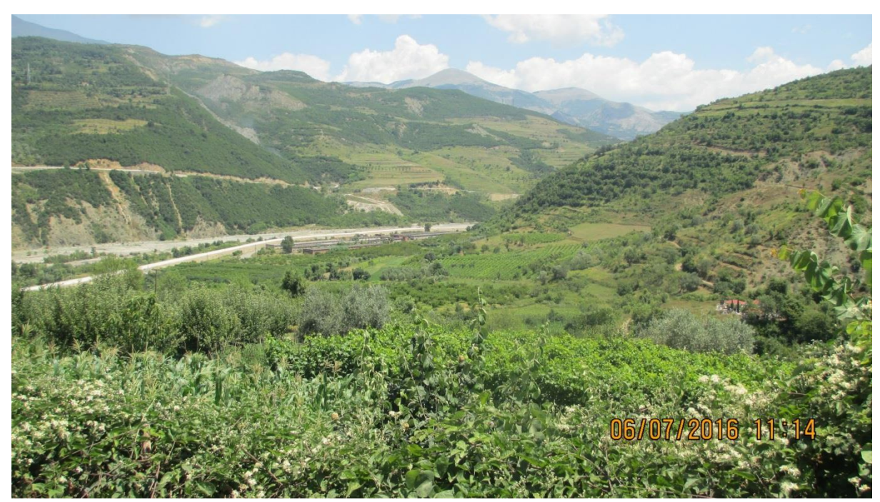
Munushtir, a valley full of orchards that might not be recognised in official papers

with a wide variety of trees growing on the land including olives, which corresponds to category I – such land would have rental value of EUR 0.39 per m2.