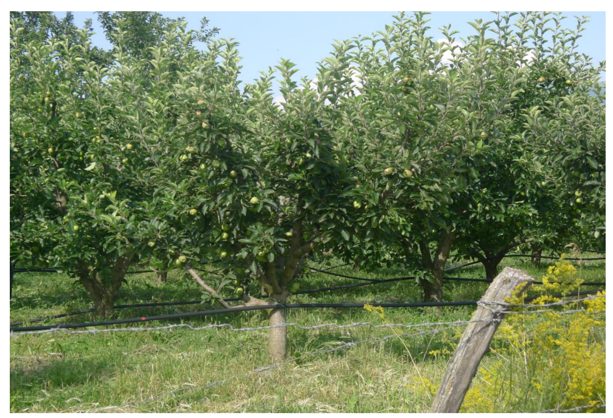
Apple orchard in Korca region impacted by the TAP construction

Several landowners also reported that they were not present while company staff was conducting an inventory of their property (including the counting of and classification of type of trees).