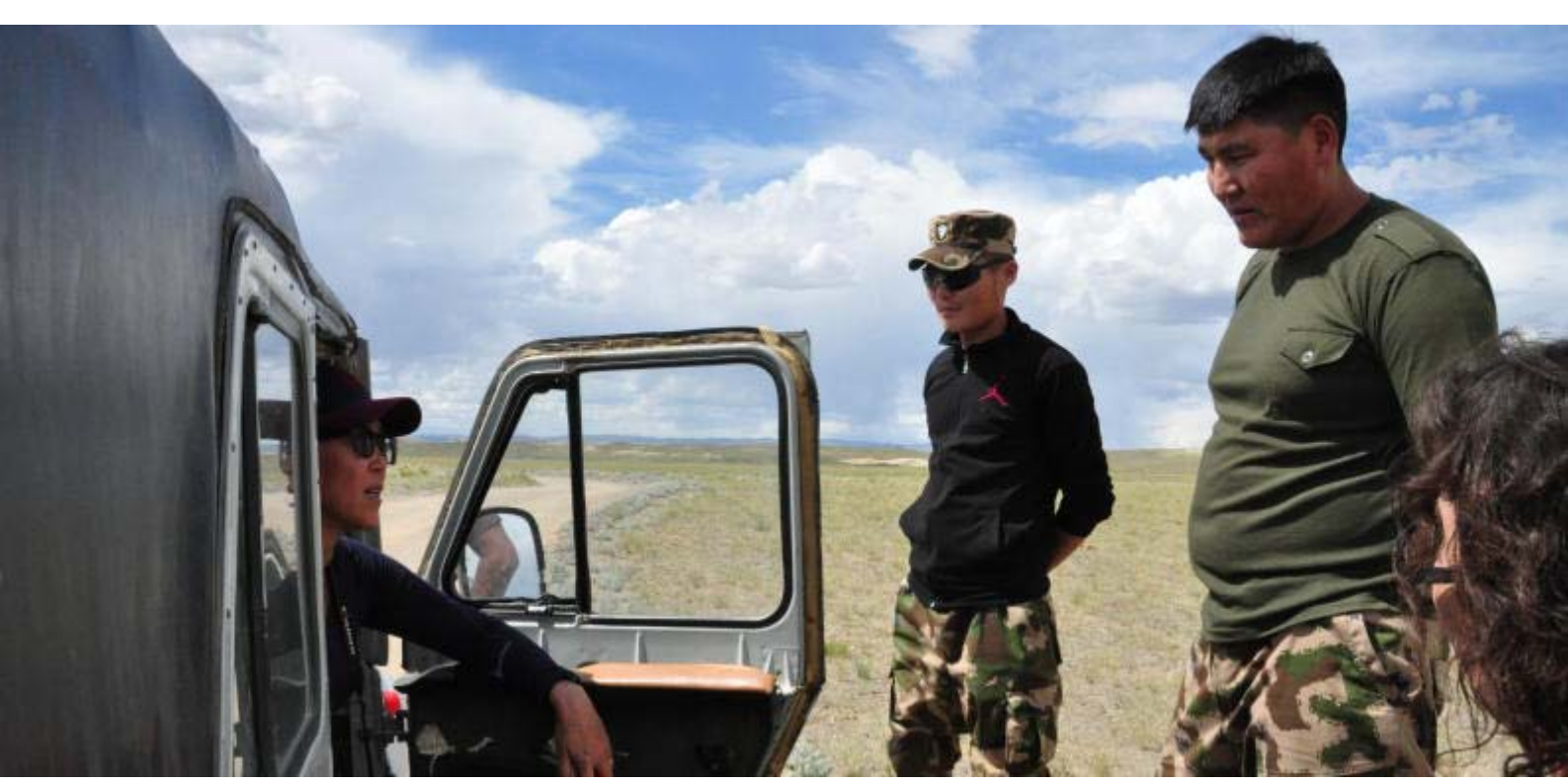
The mine's secuirty service questioning the fact-finding mission team.

members while the head of security took photos of the team's business cards and correspondence with Altain Khuder.