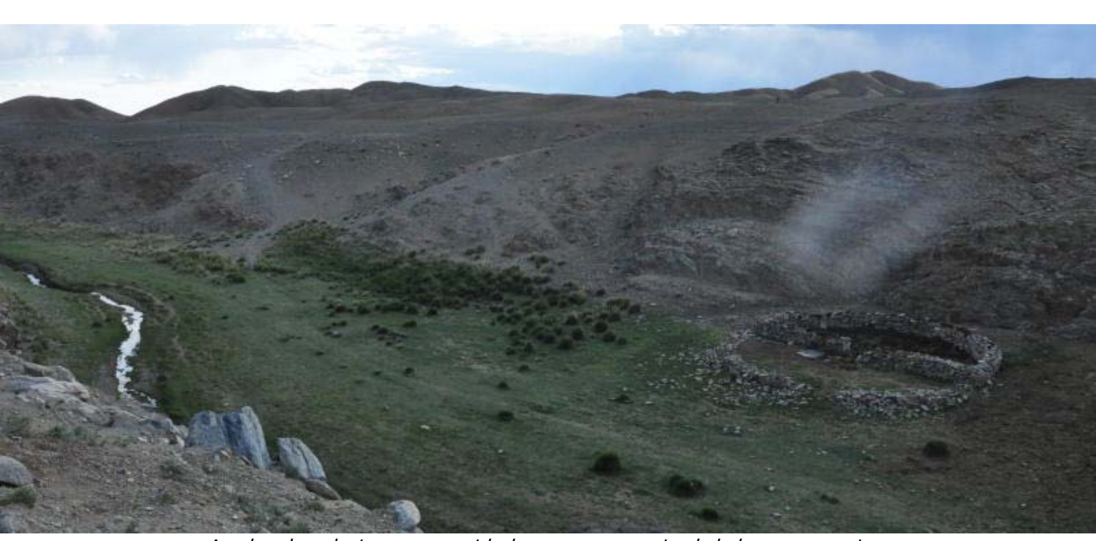
An abandoned winter camp with the permanent animal shelter construction.

During the first phase of Altain Khuder's activities between 2007 and 2011, a number of herder families who had land use rights to their winter camps at the site of the proposed mine were resettled by the company. Winter camps are the only type for which herders have land titles. These camps are 0.7 hectares on which herders set up their ger (a traditional tent with which they move to different pastures according to the season) and permanent structures to protect animals from the harsh winters. The land title does not include the pasture that corresponds to the camp. The size of a pasture needed to herd livestock varies from 5 to 30 kilometres, depending on the type of animal and the weather conditions. In total, 22 families were resettled and received compensation for the loss of their winter camp, according to the company.