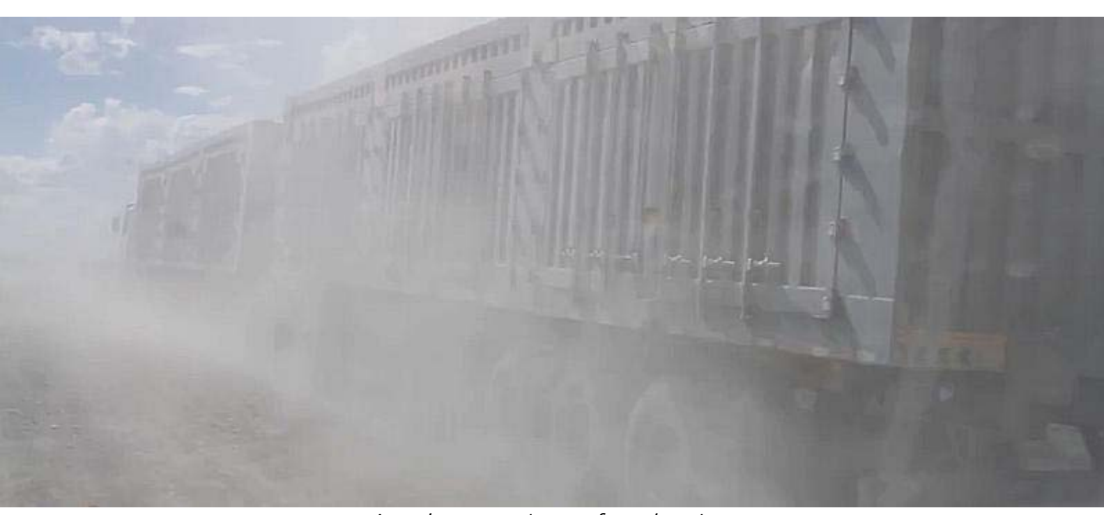
A truck transporting ore from the mine.

Herder families from the Derstei bagh area complained that as a result of the dust pollution, the quality of wool and cashmere from their animals, which for many is the main source of income, has decreased. The local cooperative leader, who mediates the sale of animal products for a community of 200 herders, reported lower quality cashmere and reduced market demand since the mine started operating. Reportedly, Chinese merchants recognise that the cashmere comes from a mining area and offer reduced prices or refuse to buy the product altogether. The company denied that these reports have 'any basis or evidence'.