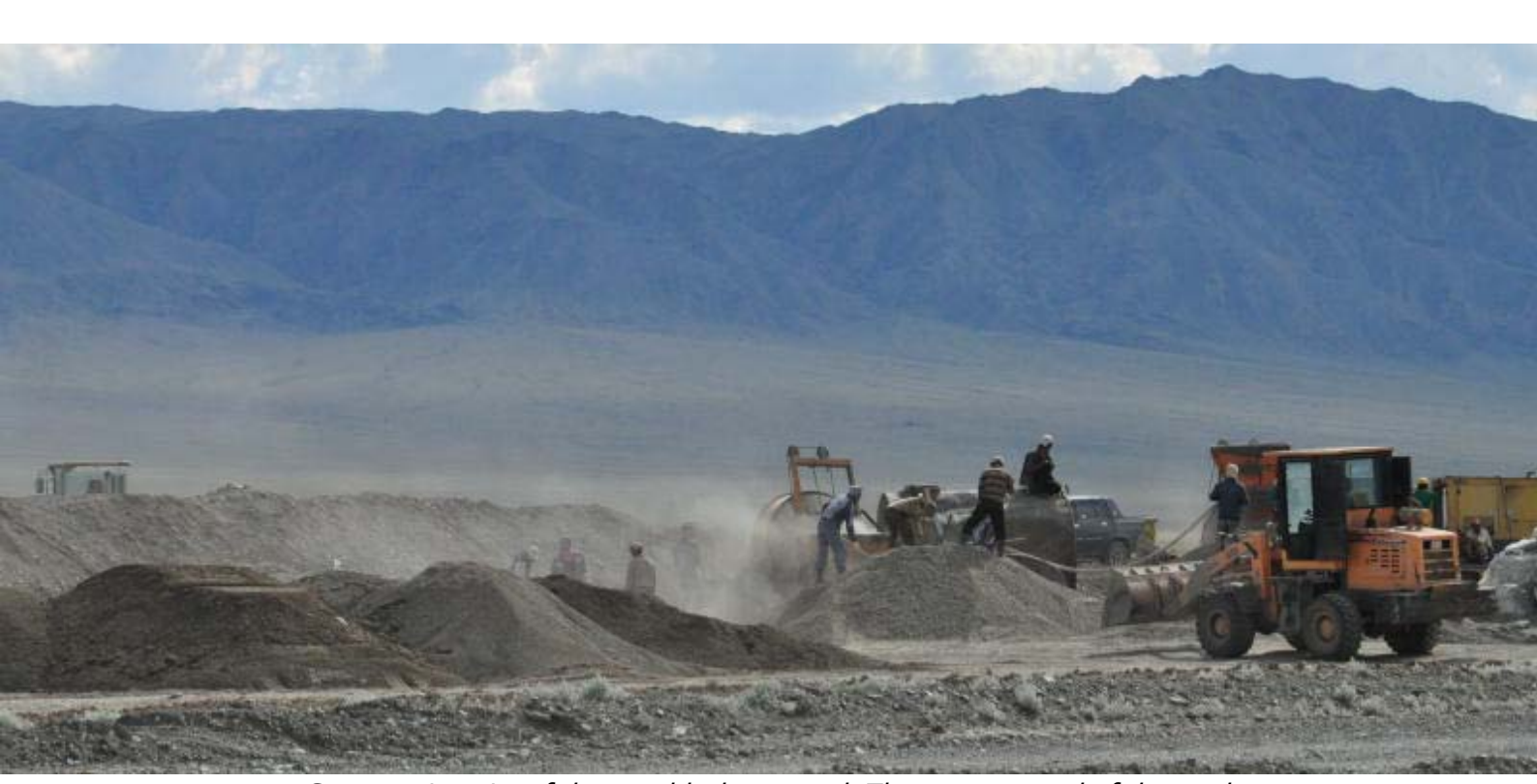
Construction site of the new black top road. The steep mound of the road can be seen in the background on the left.

Both herders and the Tseel soum government consider the construction of the black top road as a potential solution to the problem of dust pollution. However, the construction of the road has been implemented without adequately consulting the herders, despite the fact that the road cuts through their pastures, and their needs and recommendations have not been taken into account. The main problem herders say they face is a lack of passageways. The new road is slightly elevated, and without accessible and safe passageways, the animals are obstructed from grazing as they normally would.