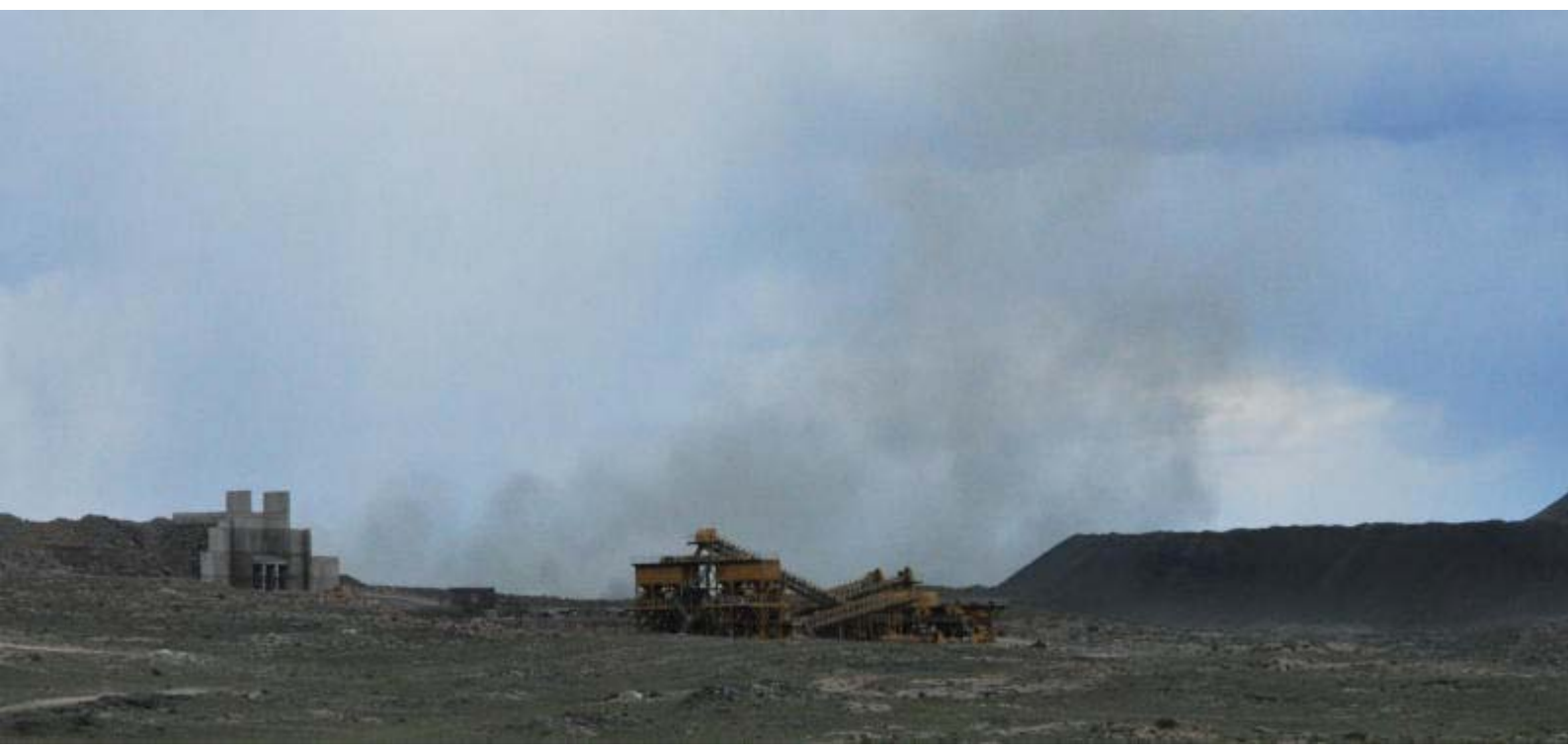
Dust rising from the Tayan Nuur iron ore mine.

dust-related illnesses. The Tseel soum governor maintains that all three sources of dust pollution need to be addressed separately in order to reverse these impacts and guarantee the safety of livestock and herders as the mine continues to operate.