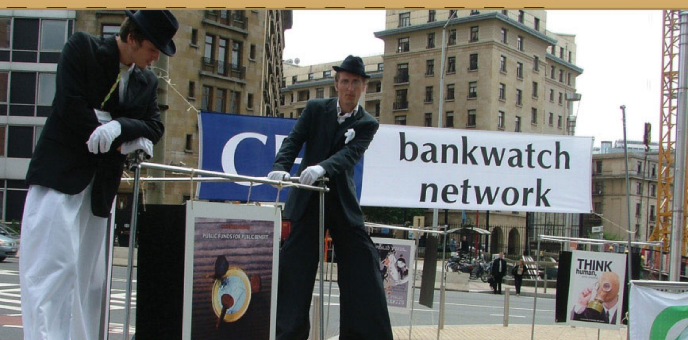
RAISING PUBLIC AWARENESS OF THE EIB DURING GREEN WEEK IN BRUSSELS

Bankwatch campaigning focuses on the problems that result from projects backed by the publicly owned IFIs (eg, the European Bank for Reconstruction and Development, the European Investment Bank and the World Bank) as well as the EU's structural funds.