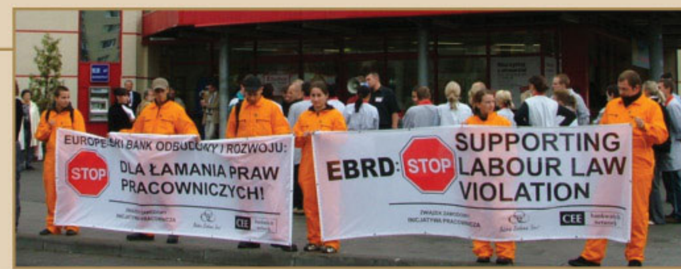
PUBLIC MONEY FOR A LABOUR LAW ABUSING SUPERMARKET CHAIN IS CHALLENGED IN POLAND

Established in 1995, CEE Bankwatch Network is an international non-governmental organisation with member organisations based all across the central and eastern European (CEE) region. The aim of the network is to monitor the activities of the international financial institutions (IFIs) which operate in the region, and to propose constructive alternatives to their policies and projects.