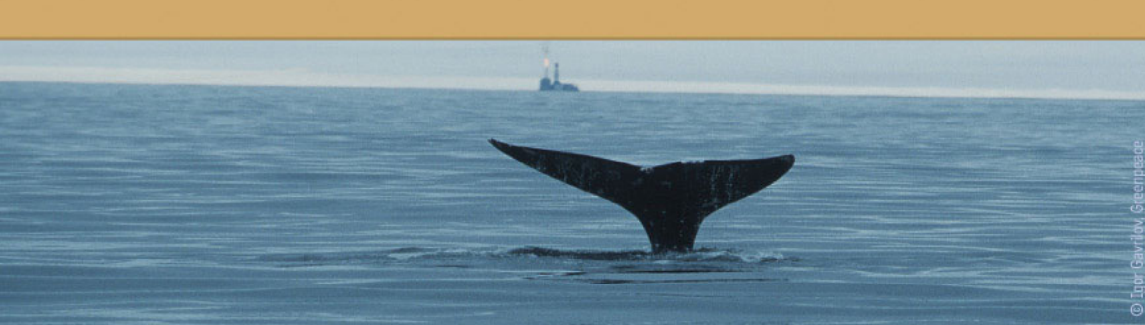
WE WORK TO PROTECT THE FEW REMAINING GREY WHALES THAT FEED IN THE WATERS OFF SAKHALIN ISLAND

Our popular English and Russian language websites provide rolling news, analysis and an extensive archive of information on how major public financial flows into the CEE region, often described as 'development' or 'aid' money, may in fact work against the interests of the people that they are intended to benefit. Our websites provide the opportunity for people to get involved directly with key decision-makers within the IFIs and their own governments in order to safeguard their communities and environment.