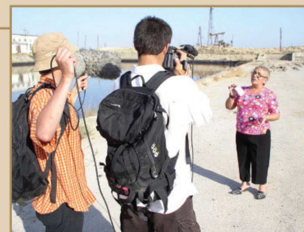
SHOOTING FILM FOR THE SOURCE, OUR AWARD-WINNING DOCUMENTARY THAT REVEALS THE NEGATIVE IMPACTS OF THE BTC PIPELINE IN AZERBAIJAN