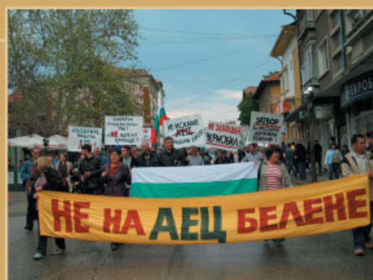
A MARCH IN THE BULGARIAN TOWN OF SVISHTOV AGAINST THE CONSTRUCTION OF A NUCLEAR PLANT IN BELENE, A PRIORITY CAMPAIGN FOR BANKWATCH