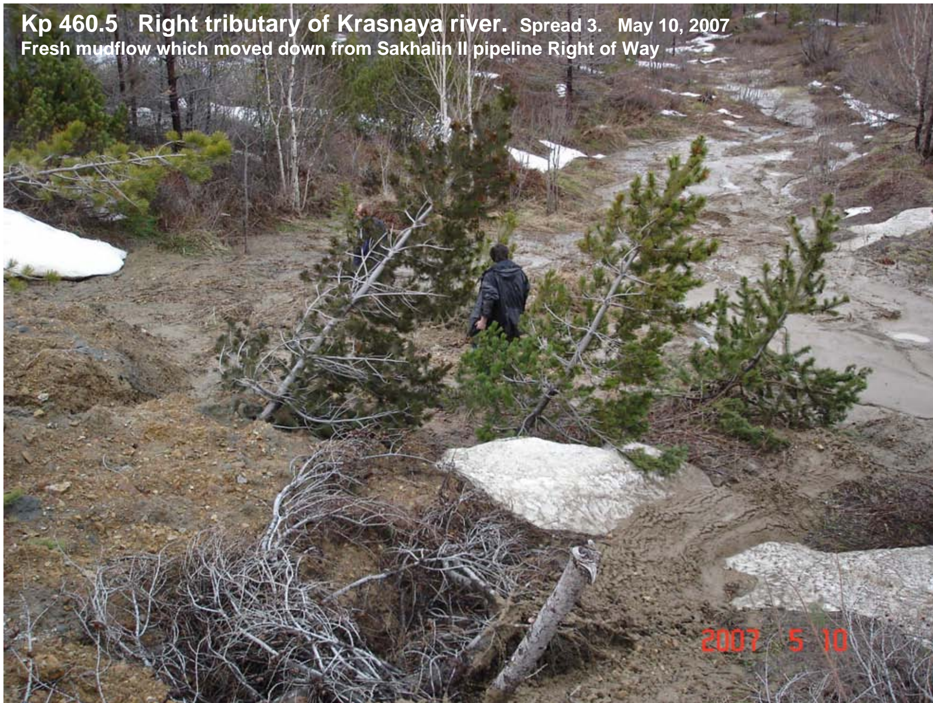
Kp 460.5 Right tributary of Krasnaya river. Spread 3. May 10, 2007 Fresh mudflow which moved down from Sakhalin II pipeline Right of Way