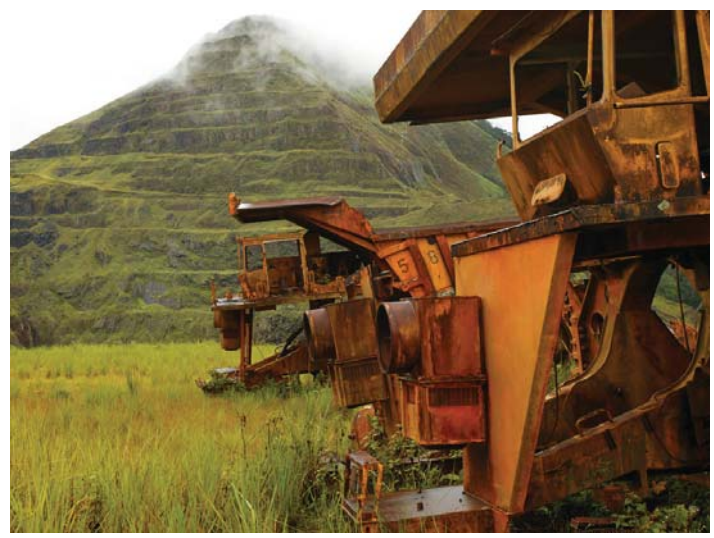
Nimba mine: rusting equipment of the Liberian American Swedish Mining Company (LAMCO) – former owner of the mine.

ArcelorMittal needs to do more to demonstrate that it actually means well for the people of Liberia. The company can demonstrate this, for example, by changing its employment policies to provide better and secure jobs for those working on different aspects of the company's project.