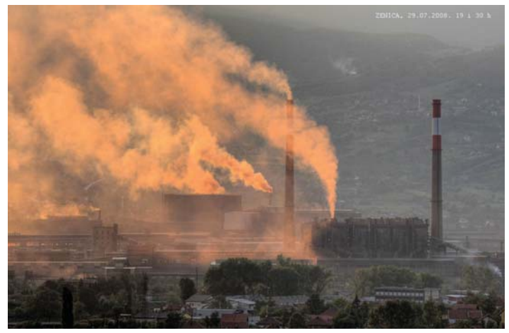
The city of Zenica suffers from very heavy air pollution from ArcelorMittal's steel plant.

On 26 September 2008, the Federal Administration for Inspection Services issued a press release detailing the results of several inspection visits undertaken to ArcelorMittal Zenica, covering environment, labour and health and safety, construction, energy, water management and forestry issues. The short excerpt on environment stated that the company was failing to measure air emissions and that it had failed to appoint a person responsible for waste management. A fine of 13 500 Convertible Marks (EUR 6750) was imposed for this, in addition to fines for other violations. ArcelorMittal has since started to measure its dust and gas emissions<sup>4</sup>, at least four years after taking over the plant — but at the time of writing no results have been released.