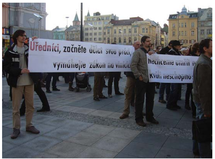
The "Do your work properly!" banner is aimed at Ostrava's regional officials regarding the regulation of industrial pollution.

Although the potential increase of production may have a considerable impact on people living around the steelworks, the public was effectively excluded from participation during the process of the steel plant's IPPC permit change. ELS together with local organisation "Vzduch" claimed that the procedure applied by the regional authority in favour of the company contravened Czech law. After these objections were dismissed by the Ministry of Environment, ELS initiated a court proceeding against the decision which is still pending.<sup>10</sup>