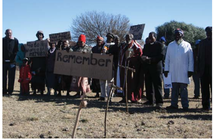
Neighbours protesting against ArcelorMittal steel mill in South Africa in 2007.