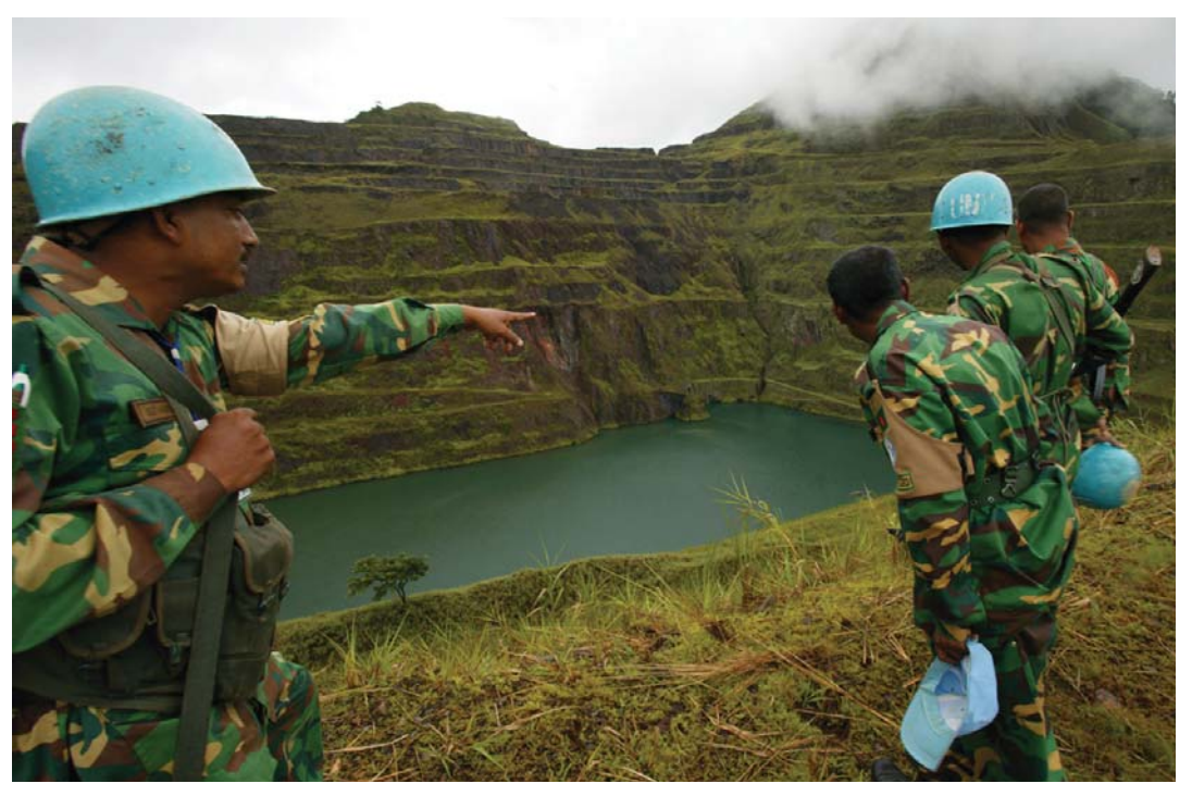
UN security forces overlooking the Nimba mine abandoned during the 14 year civil conflict in Liberia. The mine is now owned by ArcelorMittal.

Liberia, recovering from two decades of civil war and instability, is in desperate need of rebuilding its economy and improving the living standards of its impoverished population. Thousands of ex-combatants and war-affected youths need education and training. They also need employment to reduce their vulnerability to recruitment by armed groups that could take the country back to war.