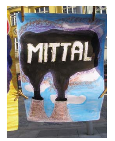
"How do you see ArcelorMittal?" paintings exhibition prepared by children living in the area affected by the air pollution from ArcelorMittal Ostrava.