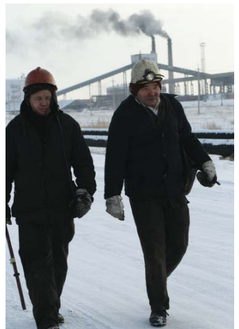
Tentekskaya coal miners.