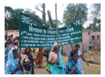
People opposing ArcelorMittal's greenfield project in Jharkhand, India at a protest in spring 2008.

The ambitious plan of ArcelorMittal to invest more than USD 20 billion in two states of India has drawn lot of protest from local tribal¹ communities facing eviction from their traditional lands. The two states, Jharkhand and Orissa, where ArcelorMittal is planning its multibillion dollar projects, are known for their tribal communities and resource rich lands. The minerals under the indigenous lands have been a curse for communities living a traditional life in these states.