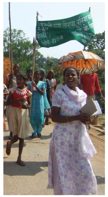
People opposing ArcelorMittal's greenfield project in Jharkhand, India at a protest in spring 2008.