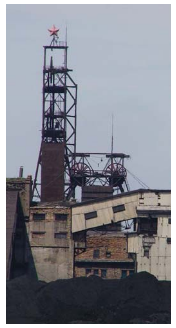
The Shakhtinsk coal mine adjacent to the city of Karaganda.