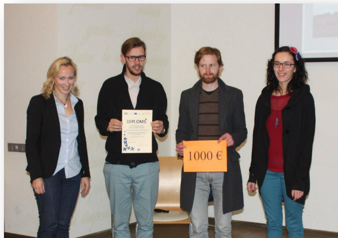
Winners Award Ceremony, Riga, Latvia 22 November 2012

The project aims to increase environmental awareness of children and youngsters and mobilize them to deal with global environmental challenges while contributing to local sustainable development in Riebiņi County. The ideas and activities have been developed by youngsters themselves and they include production of information materials and drawing books, giving thematic lectures and regularly organizing events in schools of the county and organize exhibition in the end.