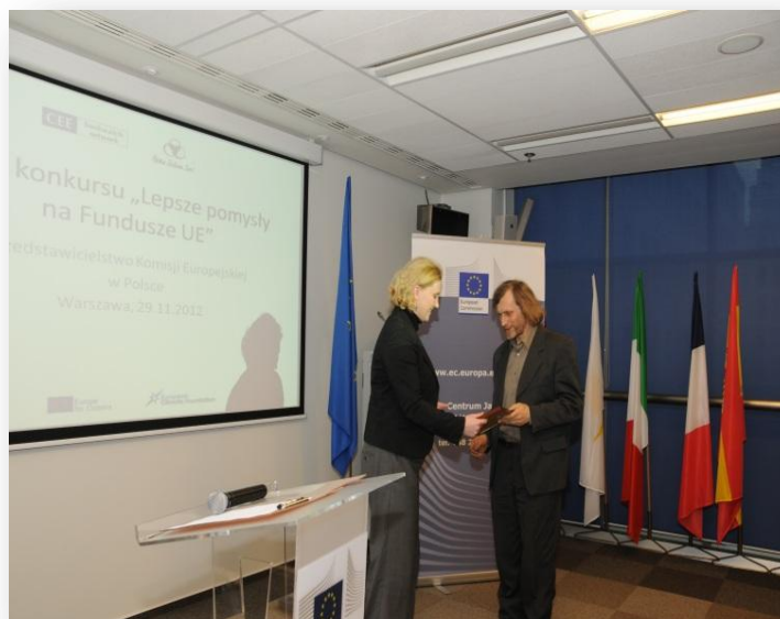
Winners Award Ceremony, Warsaw, Poland 29 November 2012

The project is based on an idea of foundation of Bio-construction Technologies Center in Kock (Lubuskie Voivodship, Poland). The idea is for the development of a professional implementation center focused on eco-passive building technologies . It will be financed from production of bio-building materials, consulting services and trainings. On the preliminary stage it would employ around 15/20 people. The foundation of the center would accelerate the formation of a new market segment in the field of residential buildings and thus would help to achieve tangible results in reduction of CO2 emissions in this sector.