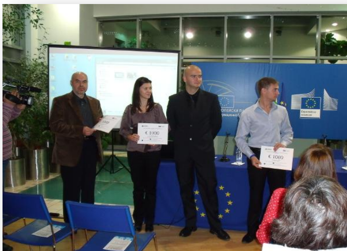
Winners Award Ceremony, Sofia, Bulgaria 23 November 2012

Favorable natural conditions, historical sights and many forest roads and trails in nearby woods are ideal conditions for the development of mountain biking, and in particular one of its styles - Cross-Country. The project aims to develop 3 routes: a short length, one for beginners and nature lovers, a 4-5 hours route for professionals and an all day long tour, combined with sightseeing.