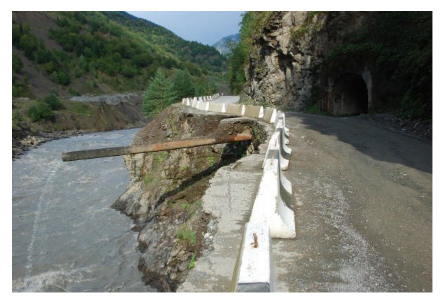
Landslides and erosion on the main road to Khaishi

Locals say that the risk of dam failure is extremely high, because Svaneti is located in a seismically active area. The elderly population even has doubts over the strength of one of the load-bearing walls of the dam. Some locals from the villages of Zhgeti and Khaishi recall that during Soviet era construction, rock samples from another location were sent for analysis, because the rock in place was totally eroded and would not be able to bear such load. The Enguri river gorge is also sedimentary and at such risks of landslides are more higher. The Dutch Commission on Environmental Assessment also recommended additional research on sedimentation and landslide processes<sup>9</sup>.