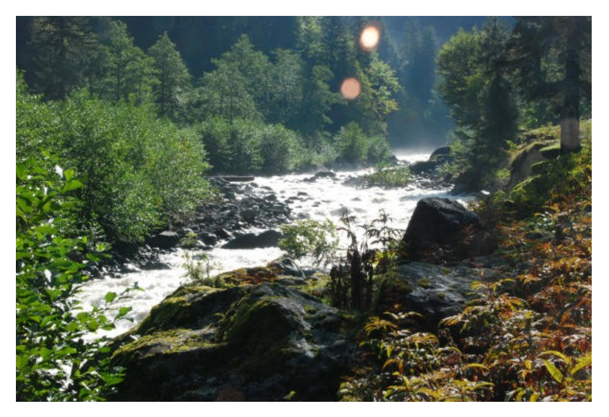
The Khaishura river and gorge

It is unclear how much forest ecosystems will be destroyed or flooded by the project. According to the EIA, the surface area of Khudoni reservoir and total flooding area are the same at 528 hectares. This is one of the most serious mistakes made in the EIA report, because the Enguri River flows in the gorge with upward slopes, meaning that the area of the reservoir surface and total flooding area of the reservoir must be different. Because of this mistake, the assessment of the project's impacts on climate change, ecosystem services and biodiversity loss are incorrect and the damages are unaccounted for.