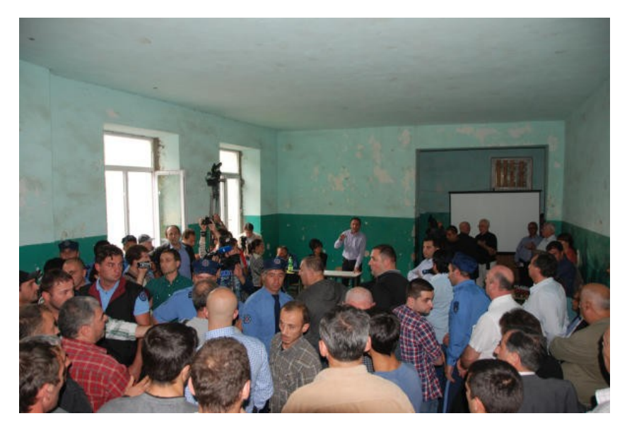
Many policemen were in the meeting room that was too small already.