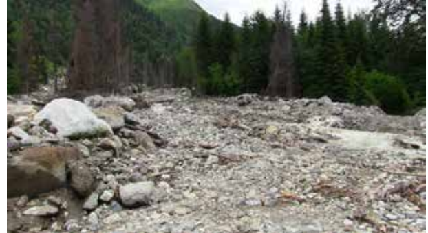
Mudslide at the Lknashera river in the vicinity of the Nakra community.

Question marks over resettlement have grown since locals found out that the installation of high voltage