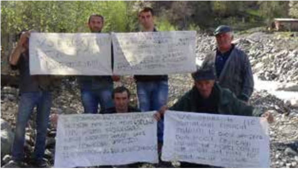
Nakra residents send messages to financiers about the planned Nenskra HPP, 23 April 2016

The area is inhabited by ethnic Svans who lead secluded and self-sufficient lives. Svans have known about the developments that could alter their traditional ways of life; the planned 702MW Khudoni dam located 20 kilometres downstream from the Nenskra dam would forcibly resettle around 2000 Svans from local villages. The failure to recognize the cultural and property rights of Svans and properly identify the impacts of hydropower on their livelihoods has created fierce opposition to Khudoni. Similarly, the poor quality assessment of the Nenskra project, together with the neglect of the opinion of locals, threatens to aggravate the fading public acceptance of Nenskra. 4