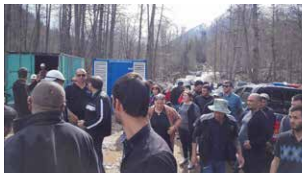
The residents of Chuberi block an access road and demand the halt of construction works on the Nenskra HPP on 26 April 2016.

In light of the facts above, the ADB, together with other international development financiers should suspend consideration of the Nenskra project and any other hydropower project until the Georgian government adopts a comprehensive strategy for the hydropower sector and raises the bar of environmental and social regulations so that they are in line with the EU laws. 10