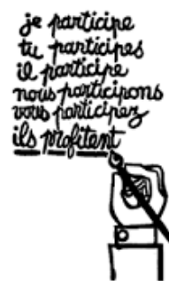
FIGURE 1 French Student Poster. In English, I participate; you participate; he participates; we participate; you participate . . . They profit.

There is a critical difference between going through the empty ritual of participation and having the real power necessary to affect the outcome of a process. This difference is brilliantly displayed in a poster painted by French students to explain the student-worker rebellion in 1968. The poster highlights the fundamental point that participation without redistribution of power is an empty and frustrating process for the powerless. It allows the power holders to claim that all sides were considered, but makes it possible for only some of those sides to benefit. It maintains the status quo 1 .