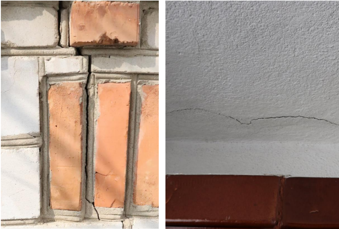
Cracks have appeared in recent years in residents' homes close to the road, both on building exteriors and along the walls and ceilings of interior rooms.

Impacts from MHP's heavy road use were foreseeable. In fact, MHP acknowledged them in meetings with community members in Olyanytsya in 2010. 101 Local residents have made numerous appeals for the immediate construction of the bypass road and other measures to address road impacts, dating back to 2012 or earlier. 102 In one such letter, community members in Olyanytsya again raised concerns about road impacts and presented a series of demands to MHP to address the issue, including construction of a bypass road, major road repairs, construction of sidewalks, speed limits, and an agreement not to construct any new brigades on Olyanytsya lands until these measures are carried out. 103 The Company and local officials agreed to implement all of the requested actions, 104 but to date, we have not seen any real progress.