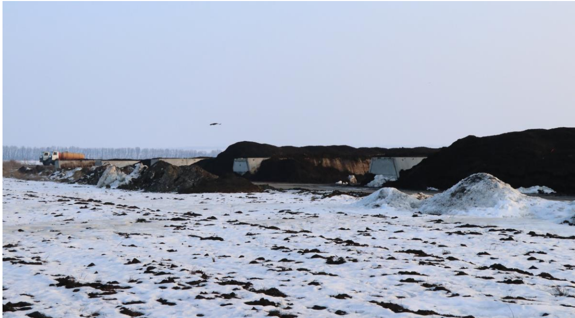
Chicken excrement lays uncovered in a manure storage facility.

Regarding smells emanating from chicken brigades, MHP has responded to this concern by stating that it complies with sanitary protection zone requirements, 124 characterizing the smell as “insignificant” and claiming that it “can be felt only in case of unfavourable strong wind. Discomfort is short.” 125 While the sanitary protection zone is welcome, MHP’s response has felt dismissive of what community members experience as a significant and ongoing problem.