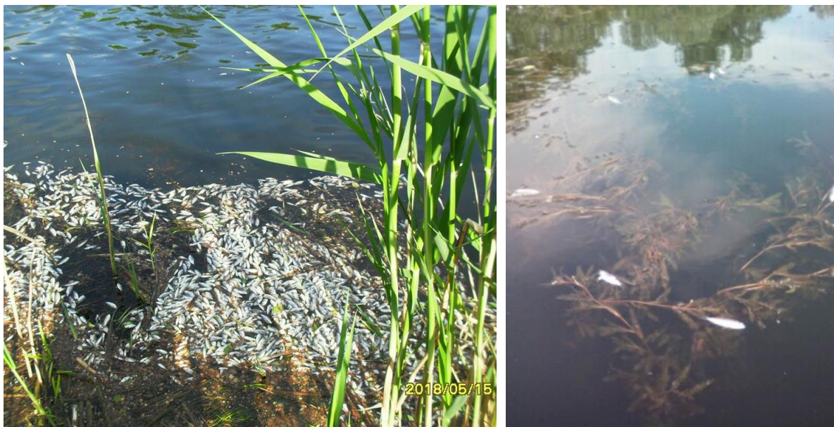
Community members reported seeing dead fish floating in the river near the outflow pipe of the wastewater treatment. Source: Facebook (see further Annex 6).

We are also concerned that other MHP practices may contribute to unknown pollution impacts, such as its use of pesticides and application of used water from poultry houses to irrigate crop land. For example, on 6 May 2017, a local resident witnessed pesticide spraying on a field leased and controlled by the Company across the road from her residence, at a distance of about 10 meters from her land and without prior notice to her. 131 Recently, on 4 May 2018, the same community member again noticed Zernoproduct Farm spraying pesticides close to her residence and without prior notice. This recent incident was again raised through a phone call to MHP's Corporate Social Responsibility team, and after that the spraying did eventually stop, but we fear such incidents may continue to occur. Community members fear that spraying of pesticides may lead to potential pollution of soil and groundwater, as well as unknown health impacts for local residents. Disposal of treated wastewater in the Pivdenny Bug River raises similar concerns. 132 For example, in May 2018 local community members noticed dead fish floating in the river near the outflow pipe of the wastewater treatment plant and we fear that this may have been related to the Company's operations. 133