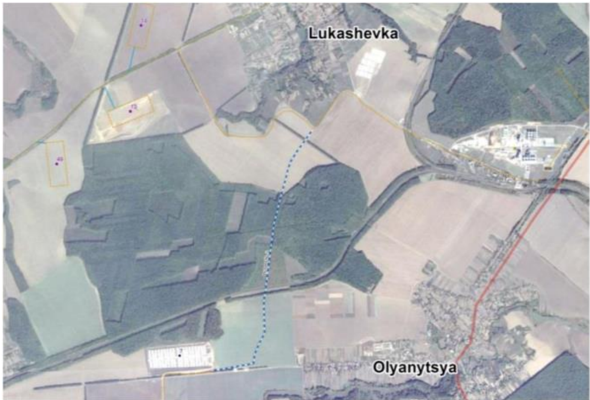
The planned Olyanytsya bypass is indicated by the blue dotted line.

Construction has been delayed time and again for various reasons, despite continuing promises that it will be completed soon. 107 Meanwhile, the Company’s construction of VPF Phase 2 facilities has continued on time. We interpret this as a prioritization of MHP’s profit-making operations over the interests and wellbeing of local communities.