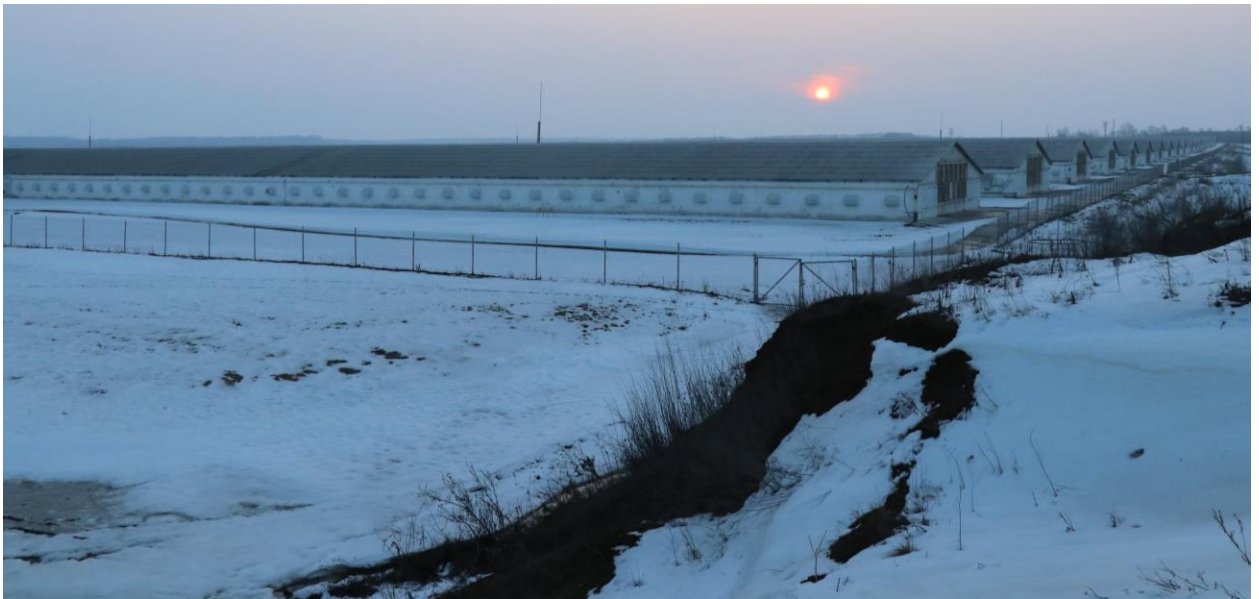
Existing poultry houses within the VPF.