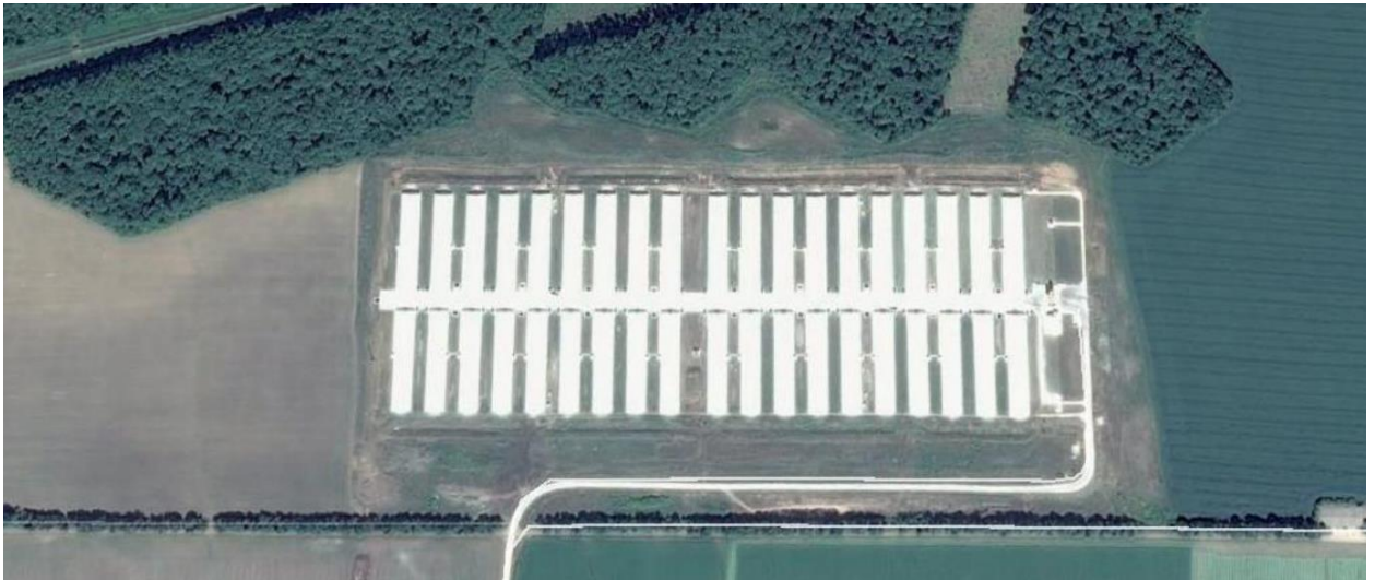
The typical brigade layout. Each brigade requires a total area of 25-30 hectares of land and can house approximately 39,060 chickens at a time. Source: 2016 OPIC Supplementary ESIA, p. 6, figure 2.3.

Each brigade consists of 38 poultry houses and has a capacity of approximately 1,484,280 chickens (broilers), meaning that there are currently as many as 17.8 million chickens being reared in the VPF at any one time. 18