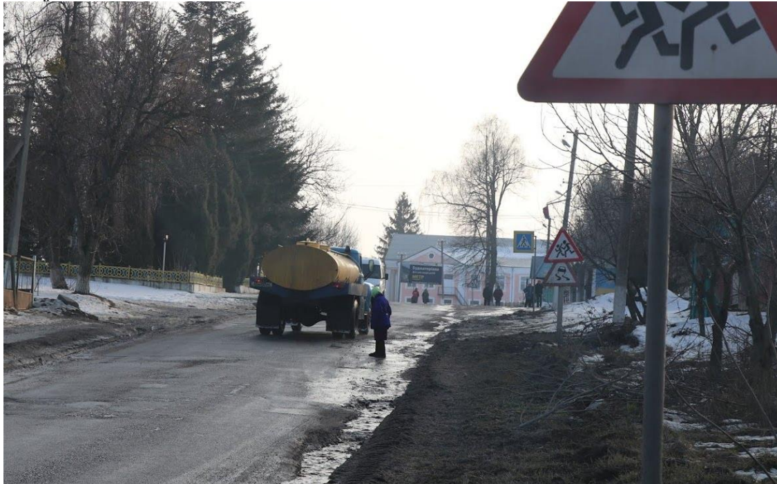
Large vehicles frequently utilize village roads creating risks to pedestrian safety and damage to physical property.

significant negative impacts caused by heavy traffic from large industrial vehicles associated with the Project.