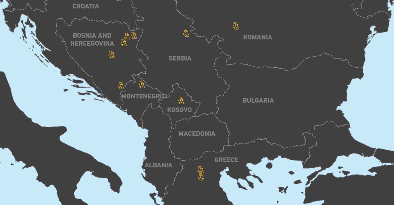
New coal plants planned in southeast Europe