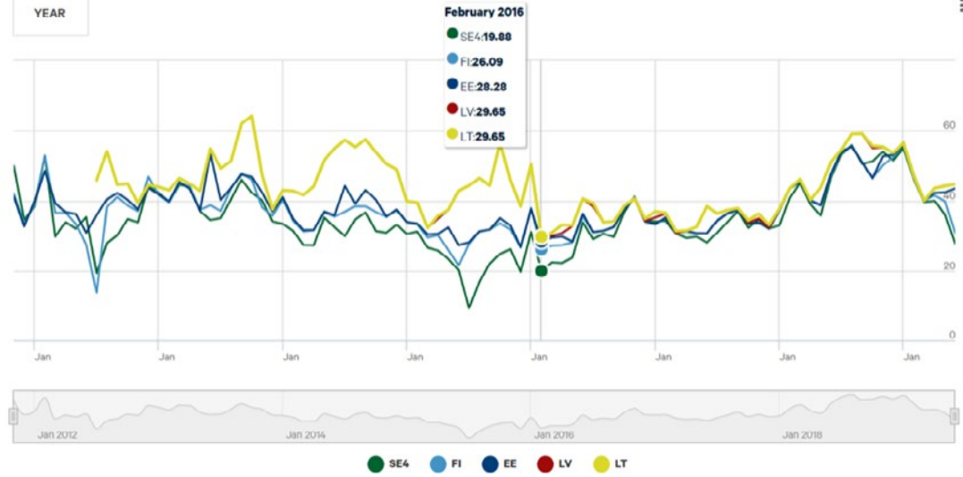
Figure 2. Power prices in Nord Pool price areas SE4 (South of Sweden), FI (Finland), EE (Estonia), LV (Latvia) and LT (Lithuania) before and after the introduction of the NordBalt HV DC submarine cable interconnection between Sweden and Lithuania

Interconnections play an essential role in ensuring the availability of capacity from electricity generation sources outside Latvia. Latvia has seven 330 kV interconnections with its neighbours: two overhead high-voltage alternate current (OH HV AC) power lines with