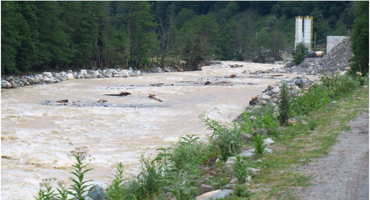
The Nenskra valley has completely changed since 2018, July 2021

We also found out that the floods from 2018 in the Nenskra valley 3 had changed completely the landscape - the wet meadows were covered with stones, most of the riparian forest was taken by the floods, the fish communities were impacted. Thus the findings and conclusions from the 2017 Environmental and Social Impact Assessment are not relevant anymore. New field surveys should be done and new baseline biodiversity data should be collected if the Nenskra Hydro Power Plant is still planned.