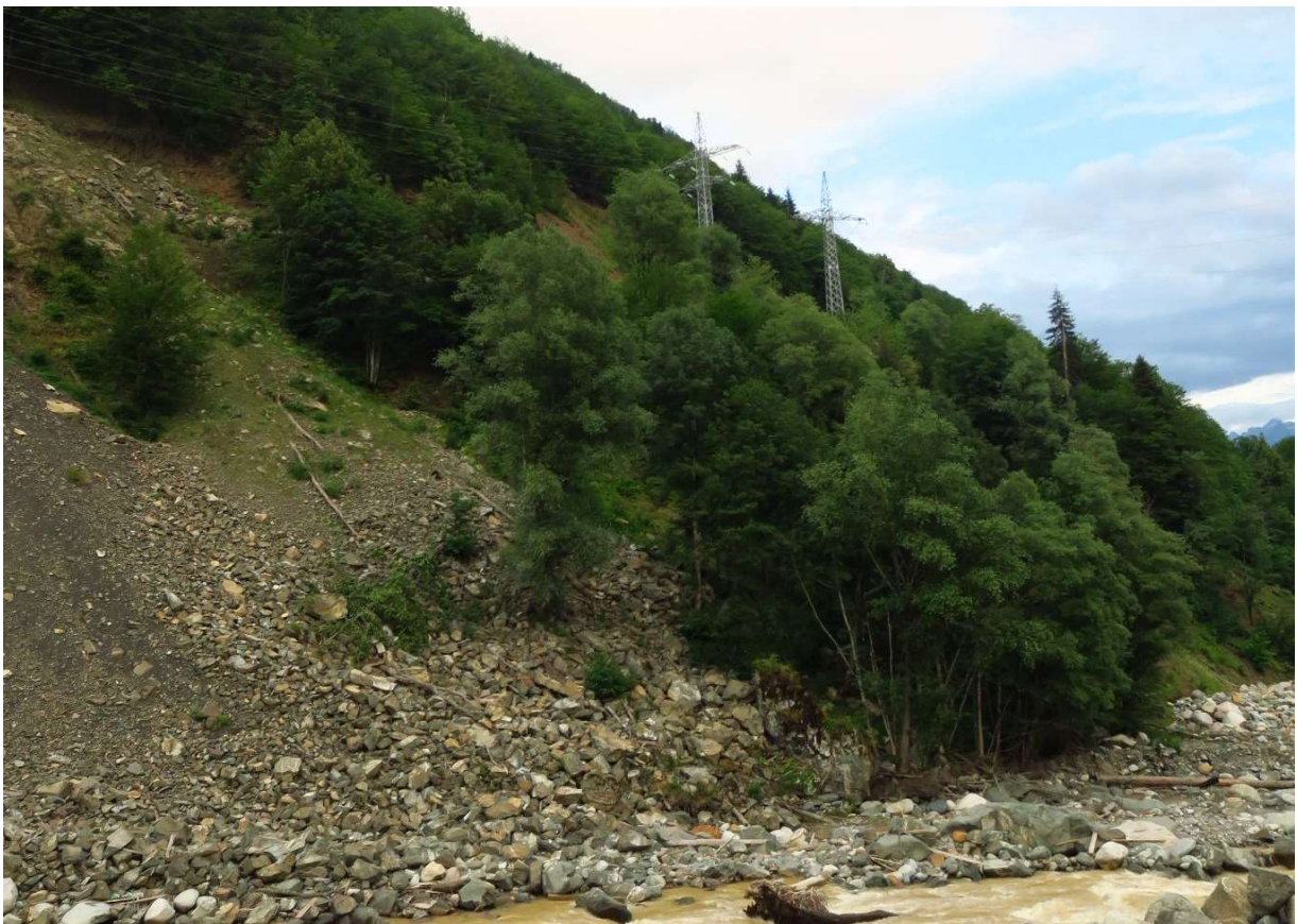
Transmission lines above the river Nenskra, July 2021

Additionally, the transmission line for the Nenskra Hydro Power Plant all the way to the planned powerhouse is already built with financing from EBRD. 2 This would facilitate the connection of the controversial Nenskra project to the grid.