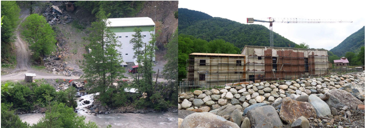
New small and medium-size hydropower plants in Svaneti, July 2021

Additionally, the transmission line for the Nenskra Hydro Power Plant all the way to the planned powerhouse is already built with financing from EBRD. 2 This would facilitate the connection of the controversial Nenskra project to the grid.