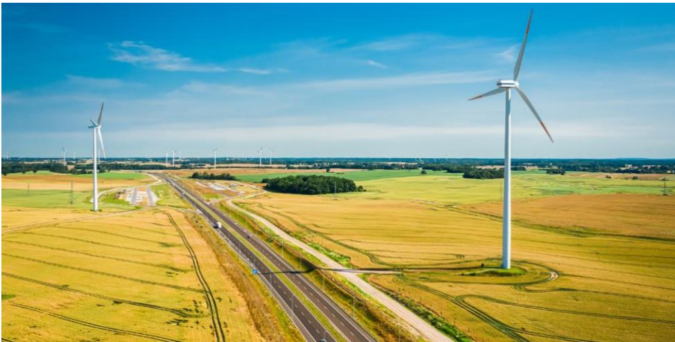
Wind turbines near a highway in Poland.